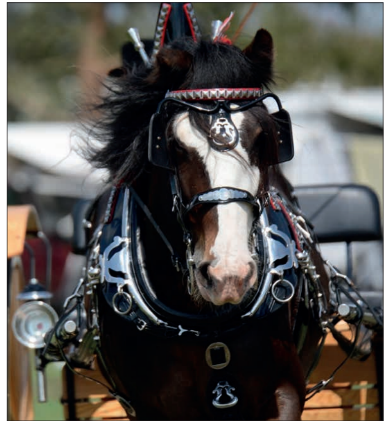
Clare's beloved clydesdale Sonny.

The light horse and ponies have not been entirely left out with harness classes for our 'smaller cousins' included. Demonstrations will also be held such as wheelwrighting, blacksmithing, horse-works and sheep shearing.