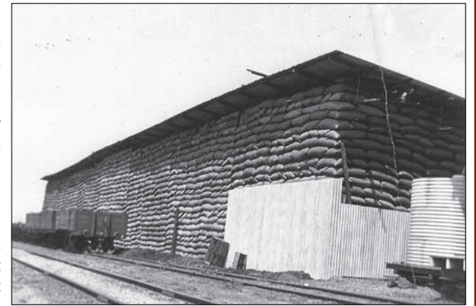
The wheat dump at Berat.