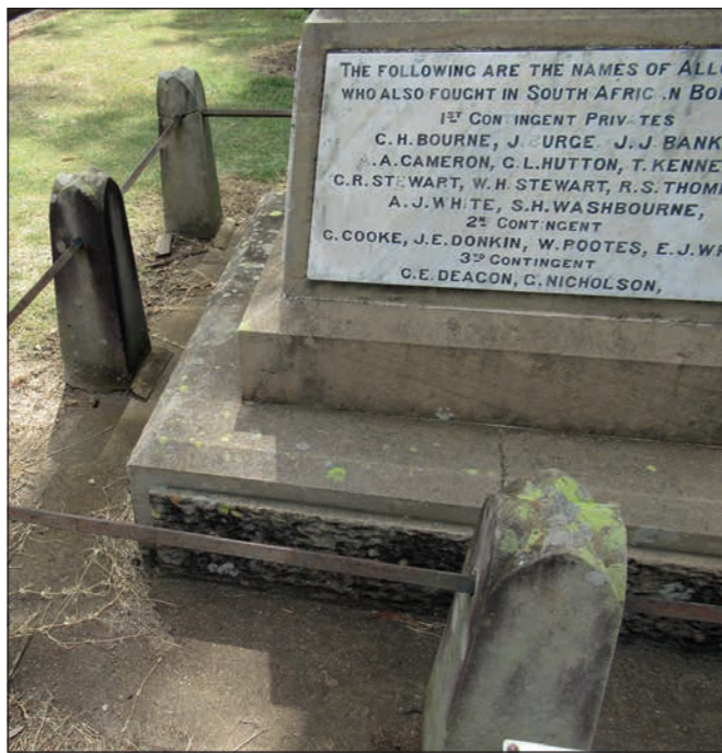
Cleaning needed and names need restoring.