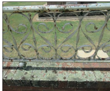
Repairs & maintenance well overdue at Allora's RSL Park.