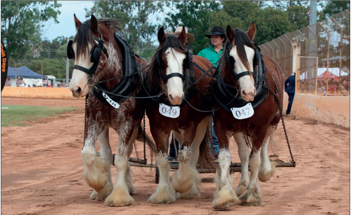
The inaugural Darling Downs Heavy Horse Festival is locked in for the 12th and 13th March at the Allora Showgrounds. Pictured are Clydesdales from the Coolibah Ridge Horse Stud at Gowrie Junction. Story inside page 3