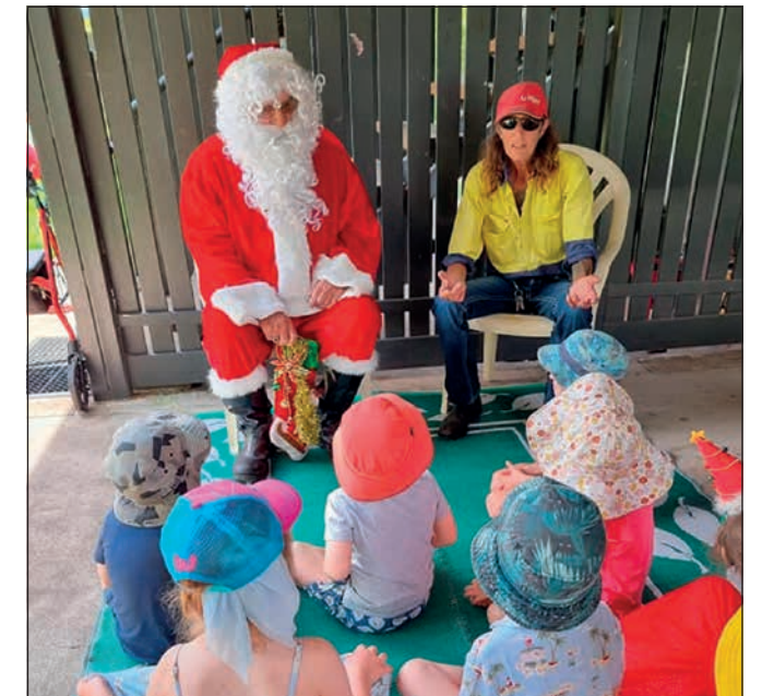
Santa and his helper.