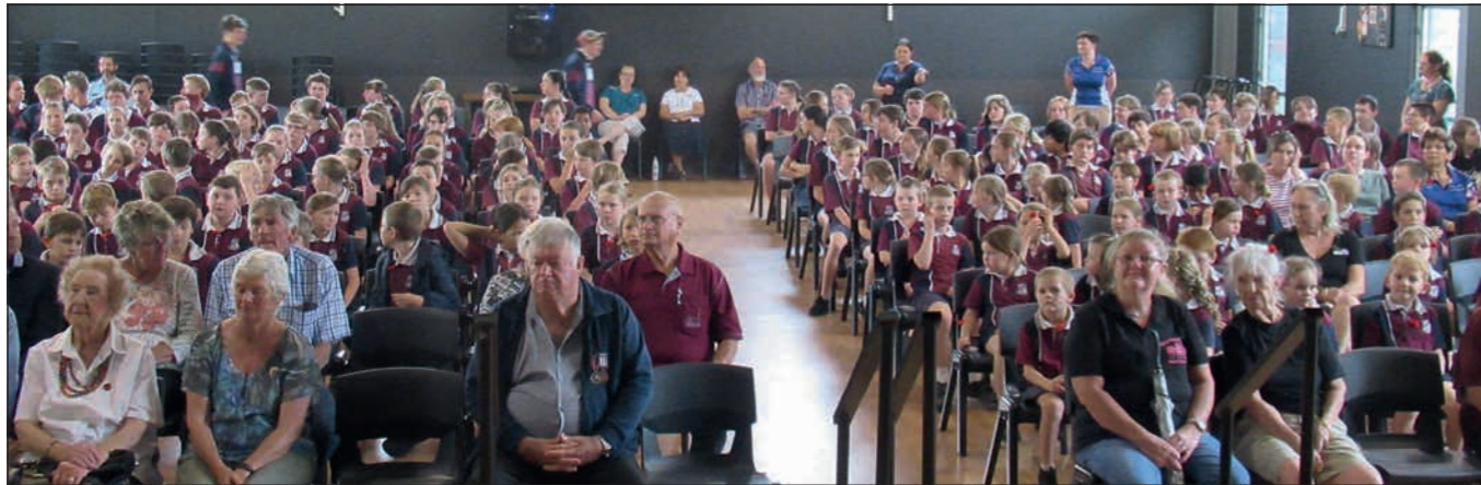
All the students and staff of the Allora P-10 State School attended the Remembrance Day service.