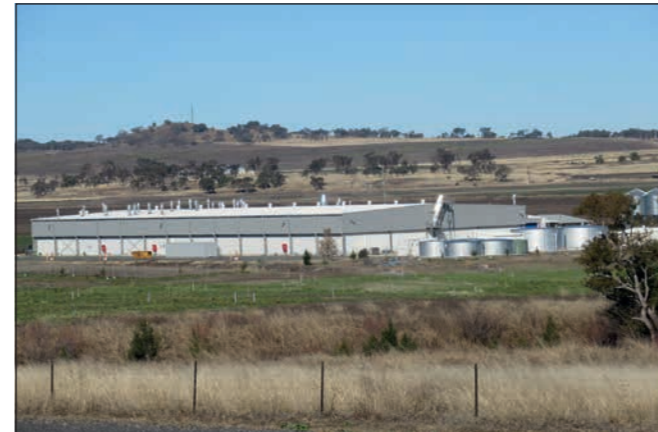
Darwalla Hatchery at Allora.

In January, Toowoomba Regional Council gave approval for Darwalla to have a poultry breeder rearing farm on Coupe Road at Sandy Camp.