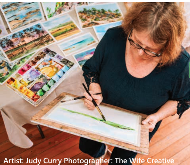
Artist: Judy Curry