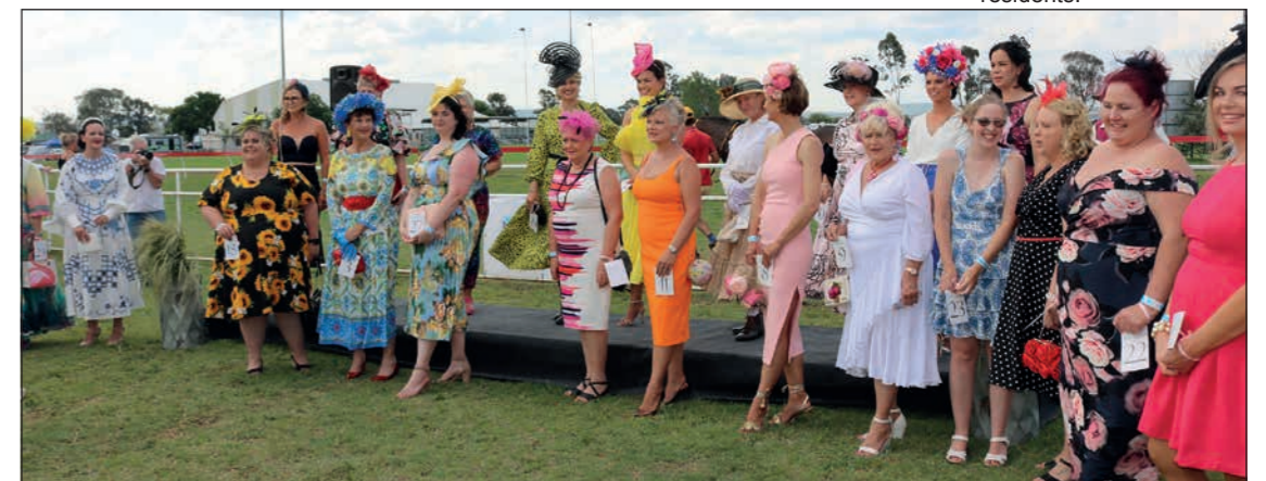
Entrants for Fashions On The Field.