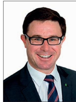
David Littleproud MP.

If you have a project that you believe is eligible for funding under the Stronger Communities Programme – an EOI