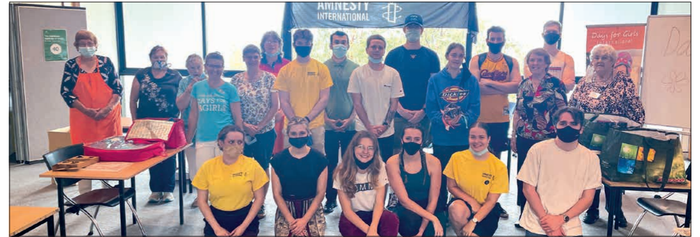
Team of volunteers at Days for Girls Packing Day at Griffith University.

The Allora Team has been working towards making and preparing Hygiene Kits in conjunction with World Vision, Canada, to distribute to Refugees in Somalia and East Sudan. Australian Teams promised eight thousand kits but actually doubled that number. Allora contributed three hundred kits, one hundred packed locally and two hundred packed at Griffith University.