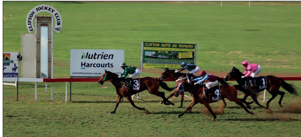
Heading to the finish of the Clifton Cup - winner Reset's Son.