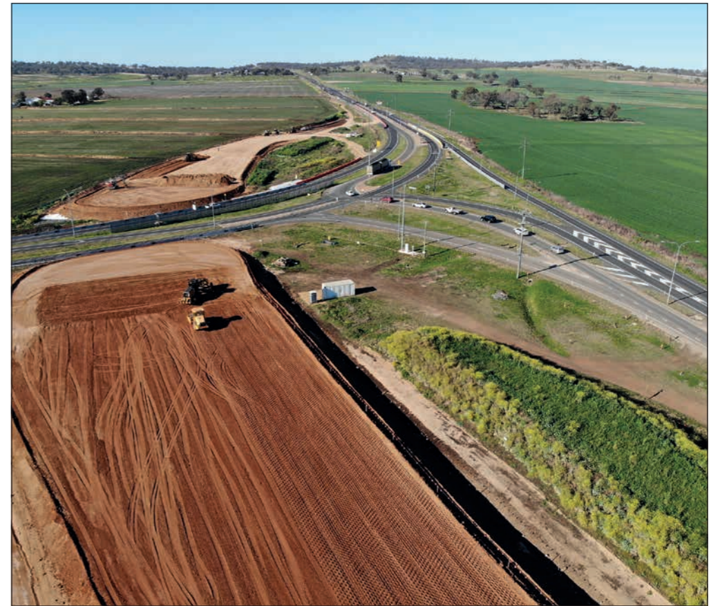
Construction at the Eight Mile intersection.

The reduced southbound merging lane remains in place. Motorists should continue to carefully follow the temporary traffic management signs, including digital message signs, at the intersection to protect the safety of