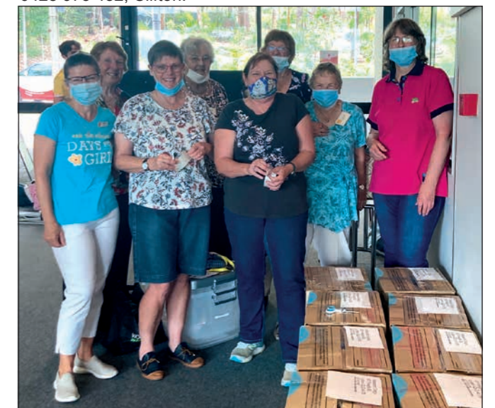
Volunteers with boxes packed and ready for shipping.

PHONE: Heather 0430 907 904, Warwick or Lenore 0428 973 432, Clifton.