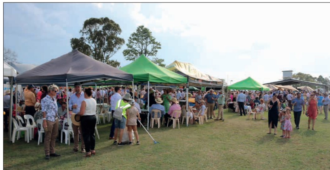
The maximum crowd of 3000 was reached around 2.15pm when the gates had to be closed on several hundred still lined up.