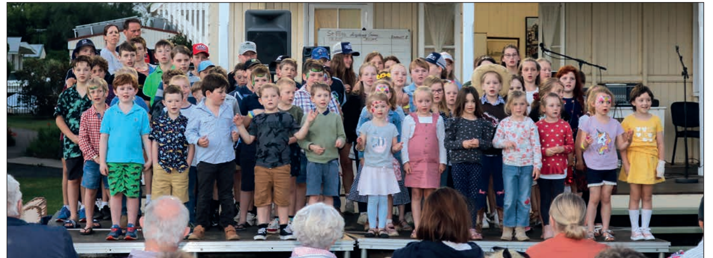
Performance by students from St Pat's School.

The weather stayed fine and the locals arrived ready for a fun time.