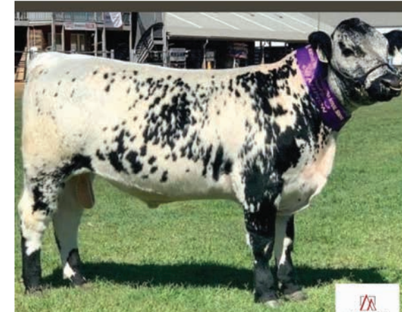
K247 Riddler R07 Toowoomba Royal Junior Champion Bull Calf 2021