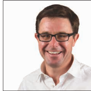
David Littleproud MP.

"This project will be aimed at attracting visitors