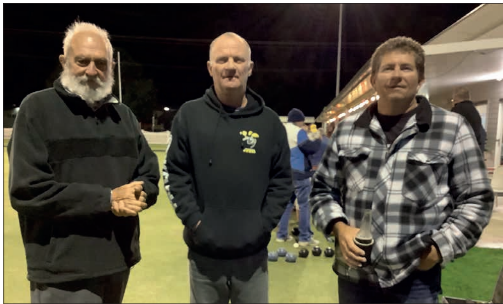
Burnt Clutch Bandits.

At the head of the list on rink 1. What a Show had their first win. They are now out of running for the 'booby' prize. They beat the substitute team for Burnt Clutch Bandits 23-2. Other results:- Rink