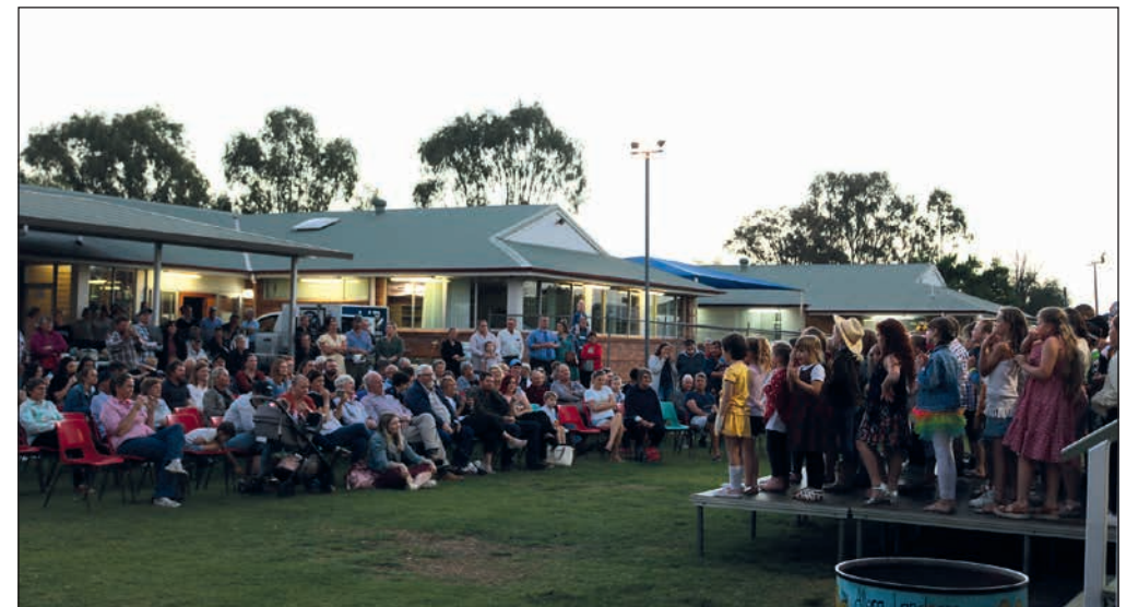
Audience relaxed and appreciating the concert.

Don't forget to pick up a copy of next week's Allora Advertiser for all the raffle ticket winners.