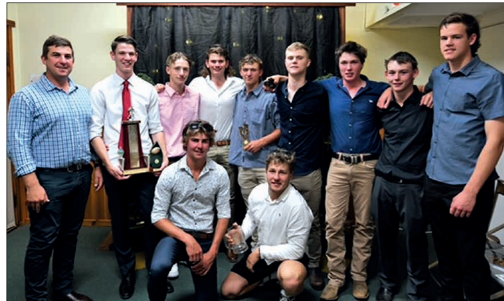
Wattles Under 18 team at the presentation.