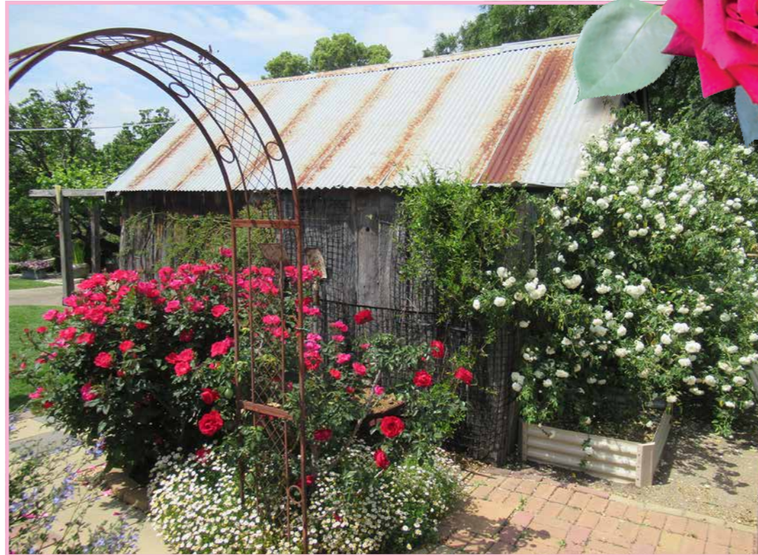
ABOVE: The white bush on the right is covered in la marque Rose or the Glengallan Rose. The showy Reds - Dublin Bay Rose and Knockout Rose