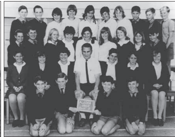
LEFT: Year Ten Class 1971