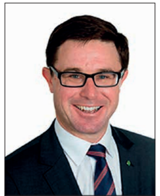
The Hon. David Littleproud MP

This provides the pathway for workers to