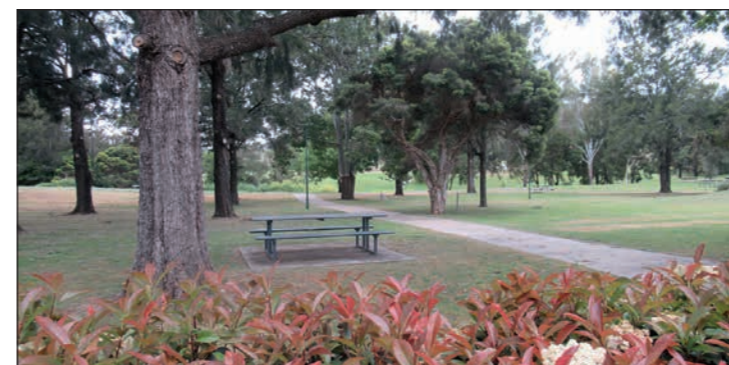
Stroll through our delightful parks and gardens.