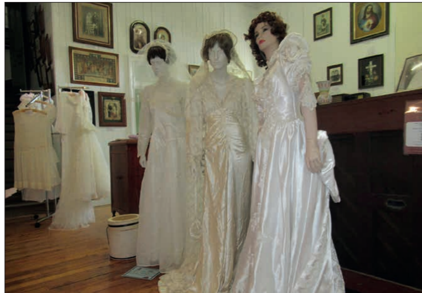
Wedding dresses worn by locals. There's also an interesting collection of Going-away outfits, Mother-of-the-Bride and Bridesmaid dresses.