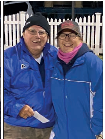
Obviously not too cold for a beer.