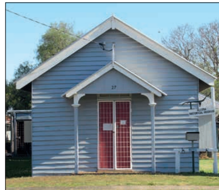
Museum in Drayton Street.