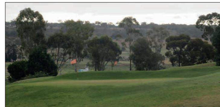
Enjoy a round on our beautiful golf course.

Pop along to the Spring Markets to be held from 8am until 3pm both days at the RSL Hall and Grounds in Warwick Street, opposite the Allora P-10 State School.