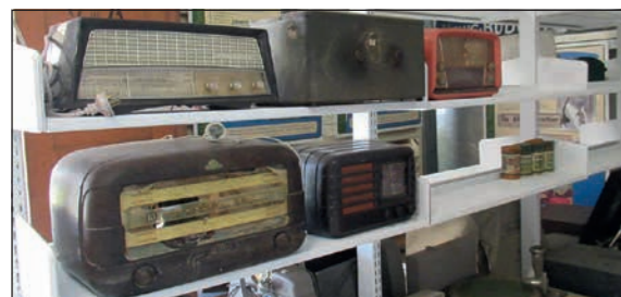
Residents of Allora and district - if you haven't visited our museums lately this is a great opportunity - you'll be amazed.