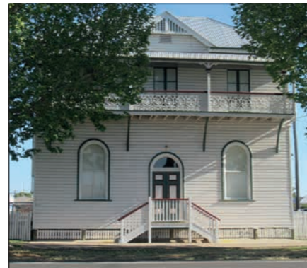
Museum in Warwick Street