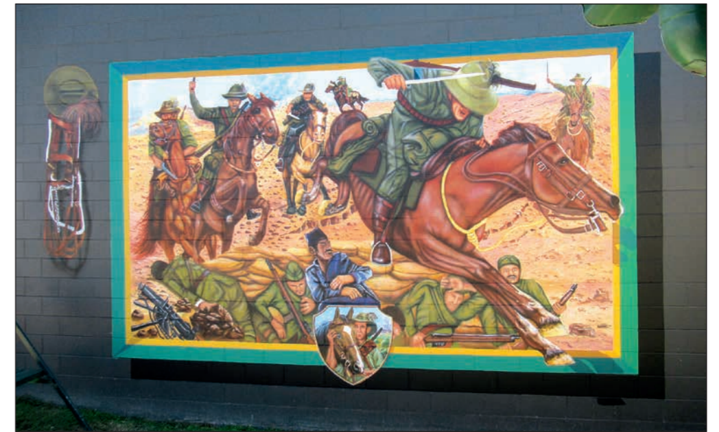
Mural at Esk.

In addition to the main artwork, a few additional images have been created, such as the base shield with a young soldier and his horse, as well as a hat and bridle to the