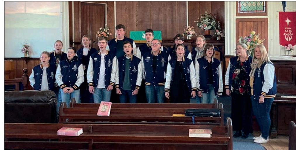
Emmanuel College Choir at St Andrew's Presbyterian Church Allora