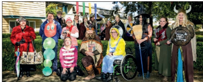
Staff came out to play.