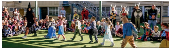
Whole School Parade.