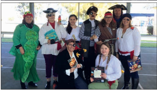
Students and teachers dressed for the Parade. This year's theme - Old Worlds, New Worlds, Other Worlds.