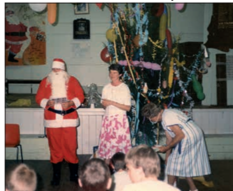
A Christmas Party in the Goomburra Hall in 1987.