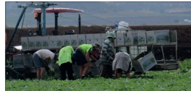
Seasonal workers are vital for primary producers