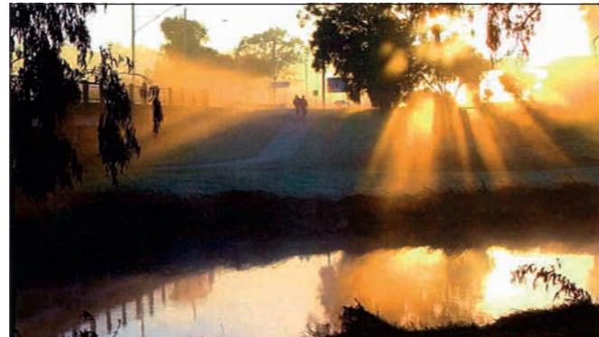
Sunrays on the Condamine (with O.O. Madsen bridge).