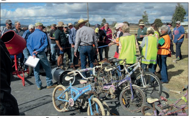
Popular community auction now cancelled.

going under the auctioneer's hammer. However, the auction has always depended on travel for many to attend. Covid-19 issues have curbed that inclination for many, and the future is an unknown. Online opportunities for bargain hunters continue to increase, with bids on the likes of ebay, gumtree etc, and the bargain sites associated with social media are also taking their toll on the likes of Showgrounds wide open auctions such as the Allora renowned event. Interested locals have suggested a change of focus to rejig a similar Allora event into the future as a weekend swap meet that may include a smaller version auction along with various community entertainment. Our community's future has certainly altered in the past 18 months, but we have the opportunity to adjust and still enjoy significant events and all our Showgrounds can offer.