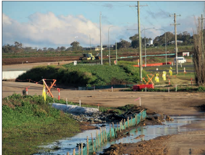
Construction at 8 Mile intersection.

The Department of Transport and Main Roads (TMR) continues to make progress on the upgrade works at the Cunningham Highway and New England Highway intersection, known as the Eight Mile intersection.