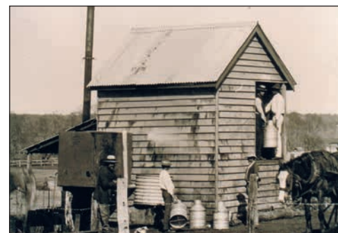
The creamery at Spring Creek in 1897 - the creamery at Forest Plain was built from the same plans.

The following generations carried on the tradition of growing vegetables until the property was sold in 1975.