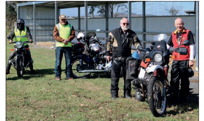
Riders from Gold Coast

The Historical Motorcycle Club of Queensland (HMC CQ) Warwick Area's event Frostbite Rally had a more than appropriate name this year as dozens of riders from around Queensland braved the chilly conditions and wet roads for a much-enjoyed weekend at Allora Showgrounds.