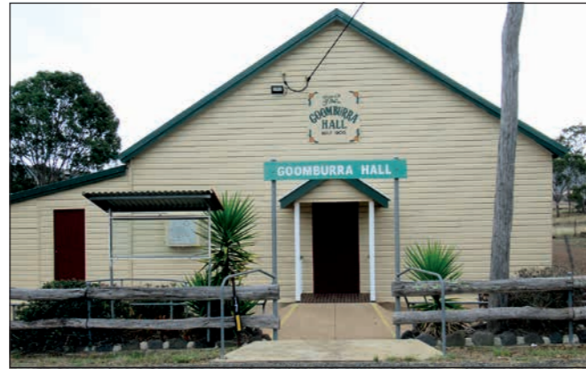
Rekindle memories at the Goomburra Hall on 11th Spetember.

The Goomburra Town Hall committee - 0429 642 092