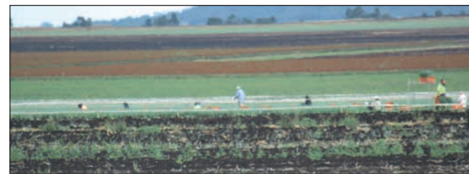
Seasonal workers on a local farm.

The Australian Government will work to have the new visa in place before the end of the year.