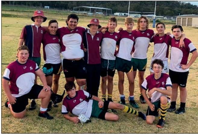
The Allora - Killamey Team at the secondary Broncos Cup in Stanthorpe.

The Broncos Secondary Competition has been held over the past two weeks.