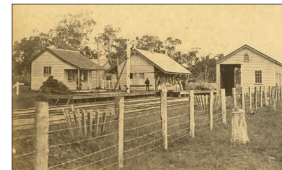
Hendon Railway Station Queensland ca. 1877.

Tenders are invited for the construction of the proposed railway from Hendon to Allora, a length of 3 miles 47 chains. The plans, sections and specifications can be viewed at the office of the Chief Engineer, Brisbane, and at the Station Master's Office, Warwick. Tenders must be received not later than 3 p.m., Tuesday 18th August. A preliminary deposit of 1% must accompany each tender. The railway will be built under the Government Guarantees Act with the cost of construction to be guaranteed by the Allora Municipal Council.