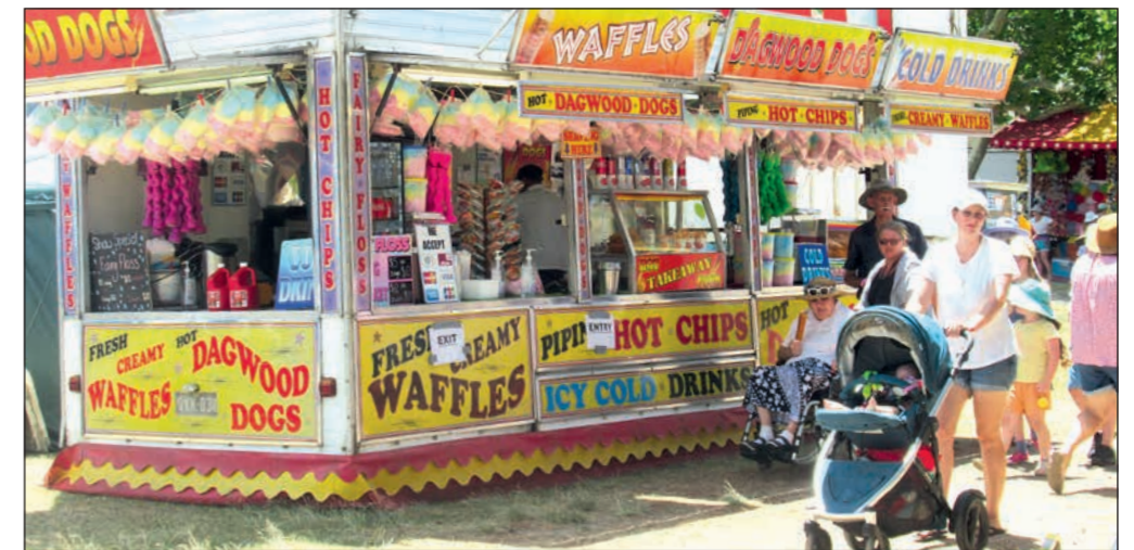
Locals supporting the popular food vans at the recent Allora Show.

"This will enable them to get back on the road and