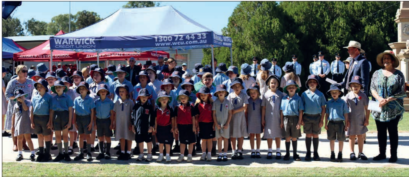
Students from St Patrick's School led the singing of the first hymn "Lest We Forget".