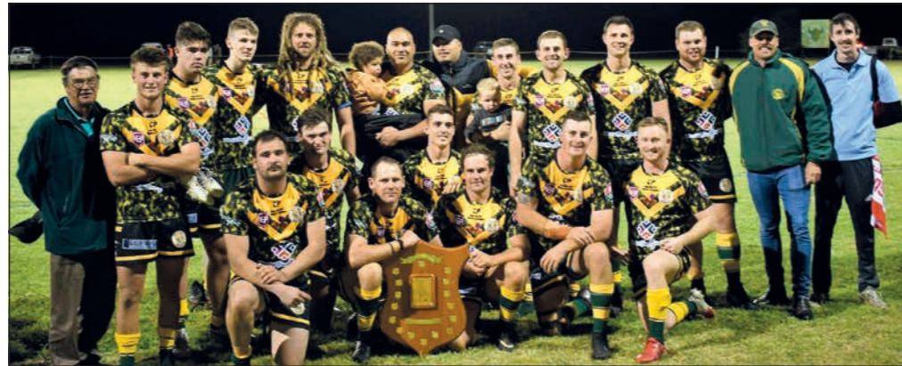
Wattles A Grade rugby league side after winning the 2021 Dan Ryan Memorial Trophy against Brothers at Platz Oval on Sunday.