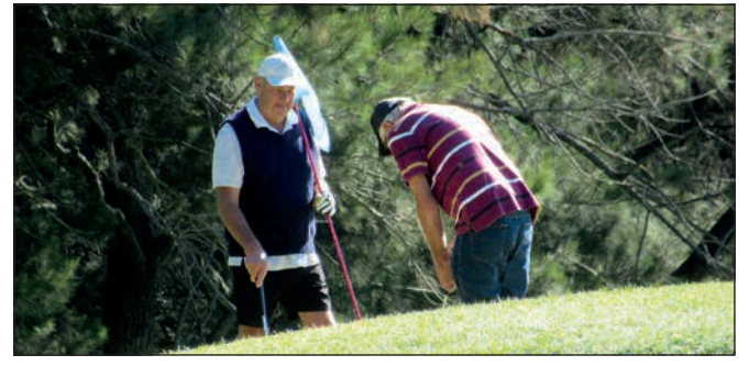
A couple of mates having a game of golf on a beautiful autumn morning at Allora.

Next Friday is the Percy's Fruit Duck Run and Sunday the Allora Butchery 4BBB. See you on the links.