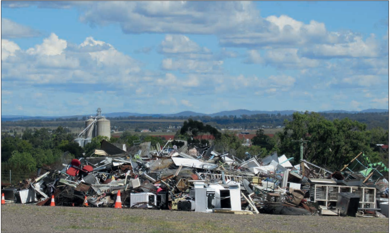
An example of the amount of household waste that is left at Allora's Waste Transfer Station - but will it remain open FIVE days a week? (continued page 3)

2023m2 Block - 3 Bedroom Home - walk to Shop and Hotel