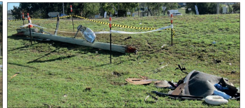
ABOVE & LEFT: Aftermath of single vehicle collision.