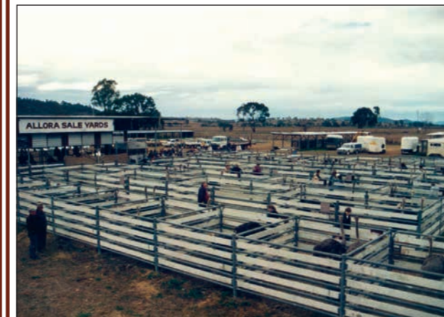
An ostrich sale at the relocated Allora Municipal Saleyards.