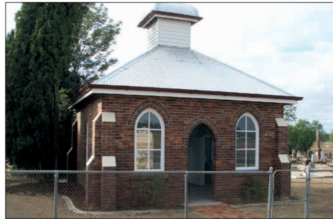
Mitchener shelter at the cemetery.

The Allora & District Historical Society conducted town and cemetery walks in February and requests have been made to do the walks again.