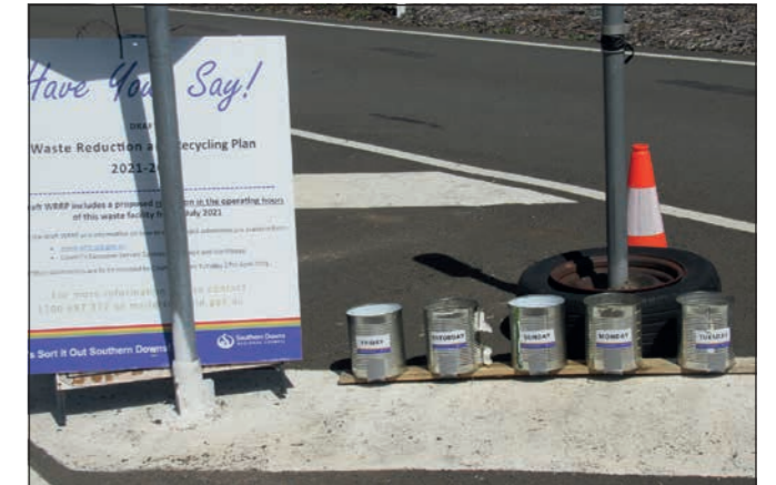
These 5 collection tins have been placed at the Allora Tip by the Southern Downs Regional Council - users are being asked to indicate what days they would like to have the facility open.

members of the community to contribute their feedback for consideration prior to submissions closing at 5pm Tuesday 27 April 2021.