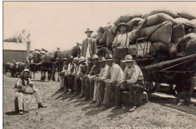
Farmers and carriers sitting on the side of the weigh bridge at the Allora railway yards waiting to be unloaded.

The wheat dump at the railway station yards is completed and haulage operations have ceased for the time being, 19,000 bags having been delivered. During the past fortnight the station yards were the centre of activity