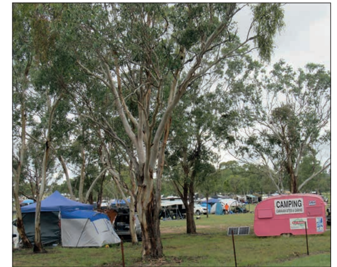
Huge crowds of campers filled almost every site at Lake Leslie over Easter.

Matches kick off on Saturday at 3.30 pm with Under 18 then 5.00 pm Reserve Grade and 6.30 pm First Grade.