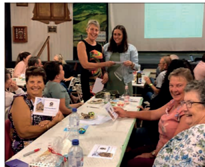
1st place winning team's table at the Goomburra Trivia Night.