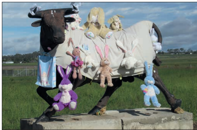
The naughty Easter bunnies came out to play - not sure if Jill's bull was impressed?