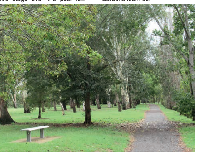
Dalrymple Park Allora

"Southern Downs is a great place to live, work, rest and play and we are committed to providing our community with green spaces you can be proud of. I thank you for your ongoing support of the excellent work our Parks and Gardens team do."