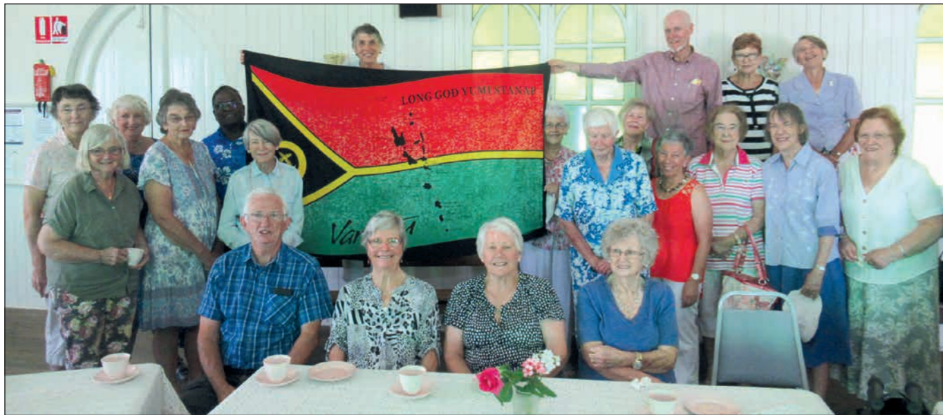
Locals gathered at St David's Anglican Church for World Prayer Day.