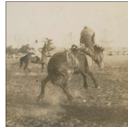
"About to take a Tumble" - a photo of a rodeo at the Allora Show Grounds. Bill Byrne is the pick-up man.

A large crowd attended the Victory Rodeo staged by the Show Society at the Allora show grounds. Improvements to the grounds, including new fences and entrance gates, had been going on for months beforehand and during the last 2 or 3 weeks working parties erected installations for the rodeo and camp