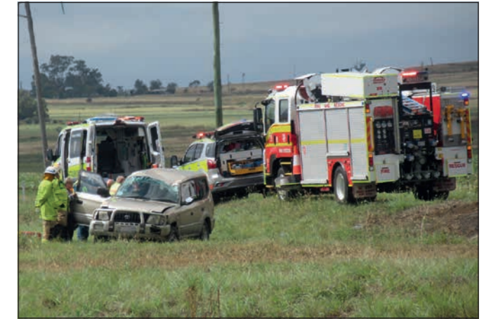
Allora Fire Brigade and Emergency Services attended this single vehicle rollover on the New England Highway, just south of Allora yesterday.