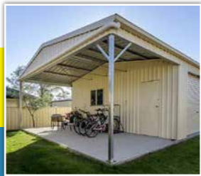
QBCC 712 053