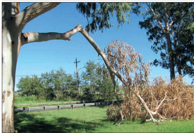
A word of advice - avoid parking, sitting or playing under Gum Trees in Dalrymple Park. This is not the first gum tree in the Park to have a large broken branch come down.