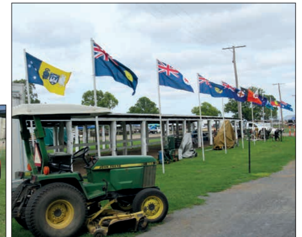
Plenty of good rain at last year's Heritage Weekend but not enough to deter visitors.