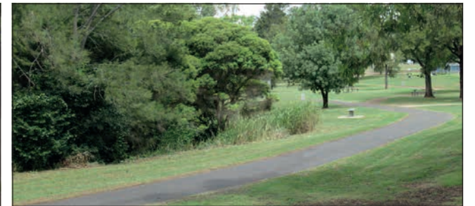
Visitors to town can enjoy what is part of life for our happy locals. Stroll around the walking track that takes you from Dalrymple Park to Apex Park. On the way, the kids can enjoy skateboarding, swimming or playing on the swings. Stop off for coffee or a game of golf.