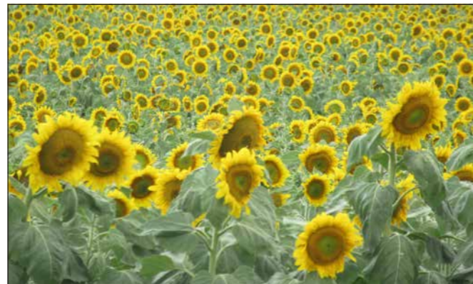
The area is known for stunning sunflowers - there still may be some blooming at the 8-mile intersection.