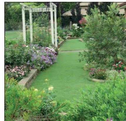
Drayton Street is worth a stroll - Beautiful gardens and historical homes.