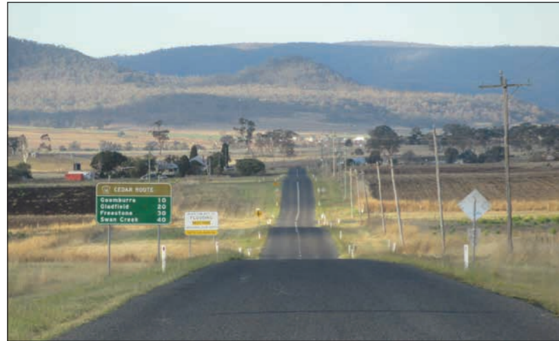
ABOVE: Enjoy a drive up the Goomburra Valley - turnoff about 5kms south of Allora.