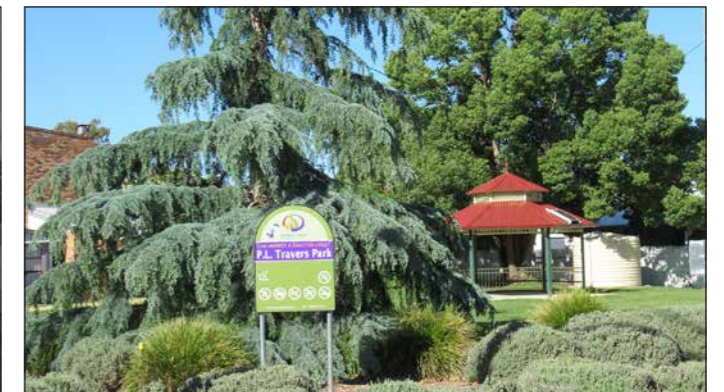
P.L. Travers Park in Herbert Street.

The ALLORA TOWN MAP is available at local business houses and the Allora Advertiser office.