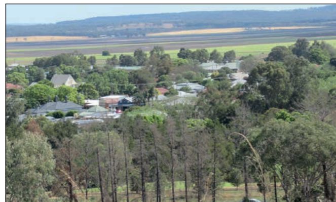
Allora Mountain via Burges Road near the waste transfer station on the New England Highway