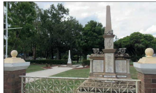
Memorial Park in Warwick Street.