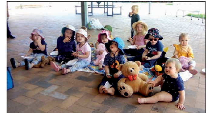
Allora Playgroup kids took part in a Teddy bear's Picnic last Wednesday morning at St Pats.