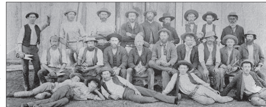
The Goomburra shearers c.1895.