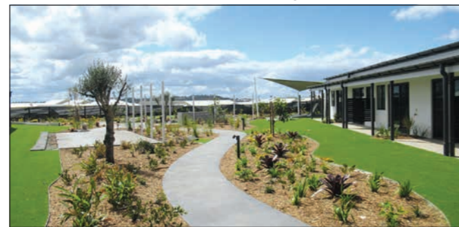
Beautiful gardens outside all the units with a barbecue area and children's play equipment at the far end.