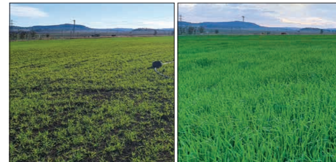
Warraba barley crop in July (left) and September (right).

"The earlier you start doing it, the more effective it will be," he said.