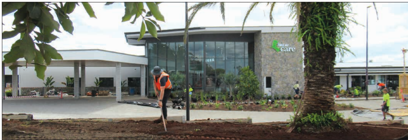
Construction underway at Palm Lakes Aged Care in Toowoomba.