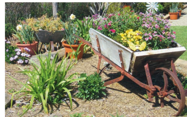
Helen's garden is a great example of how reused and repurposed items can be used in your garden to create practical and eye-catching focal points like this unique old wheelbarrow which looks stunning with some bright and colourful spring blooms added to it.

The same logic can be applied to gardening. For instance, instead of going to a hardware store and buying new materials, ask around.