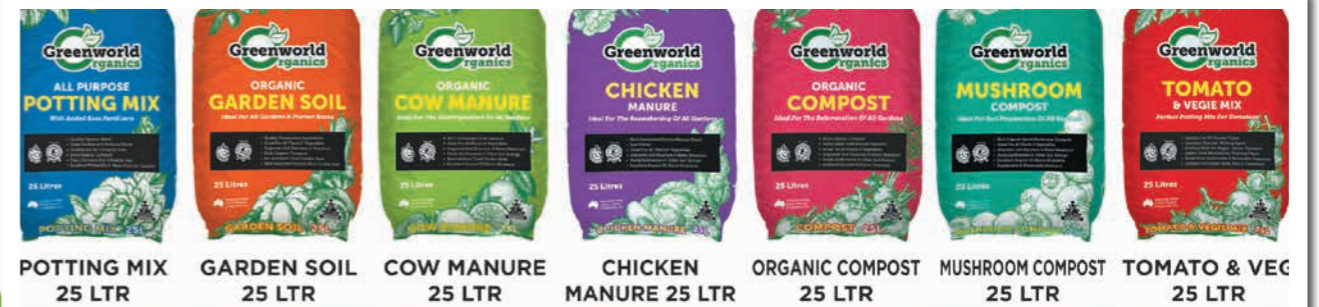
POTTING MIX 25 LTR GARDEN SOIL 25 LTR COW MANURE 25 LTR CHICKEN MANURE 25 LTR ORGANIC COMPOST 25 LTR MUSHROOM COMPOST 25 LTR TOMATO & VEG 25 LTR