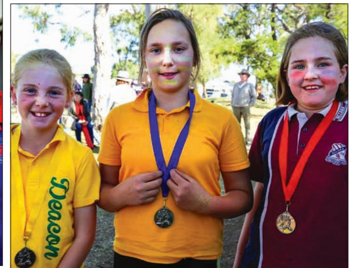
10 Years Girls Champions.