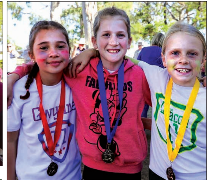
9 Years Girls Champions.