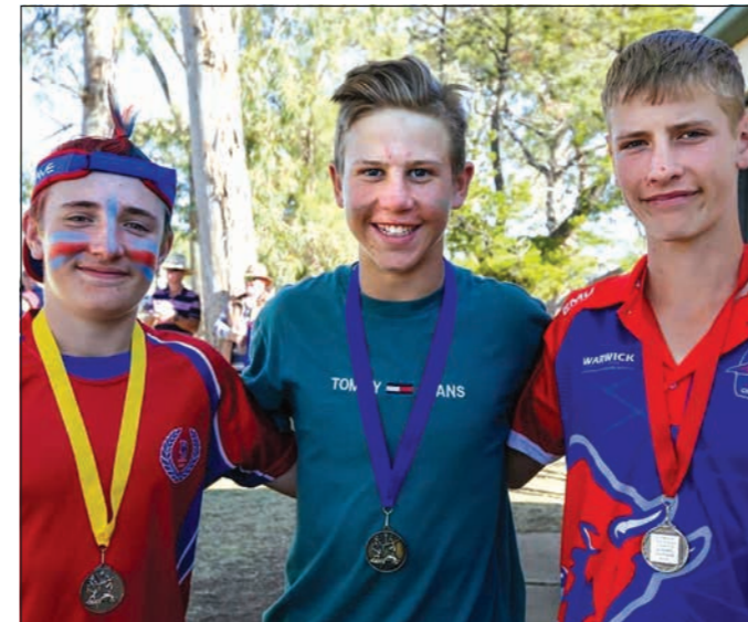
14 Years Boys Champions.