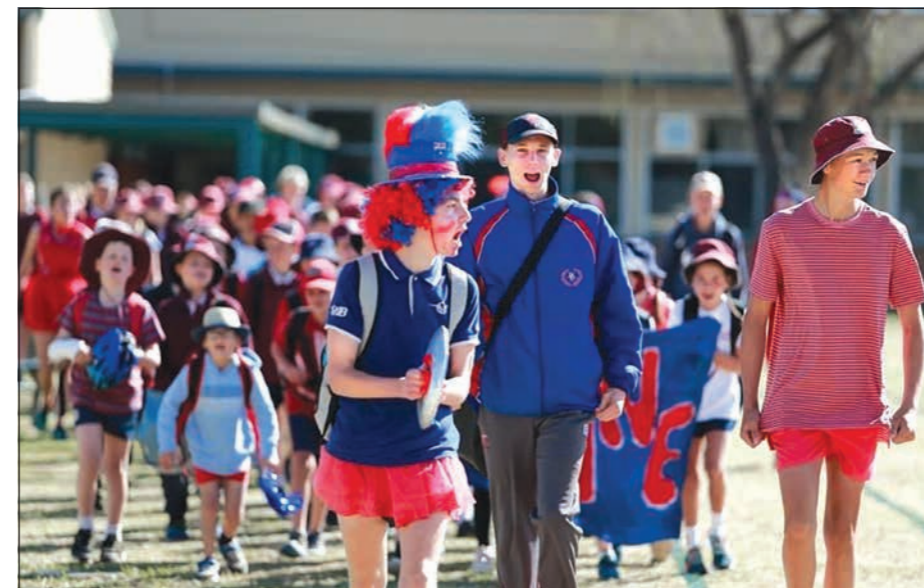
Gwynne House march by.