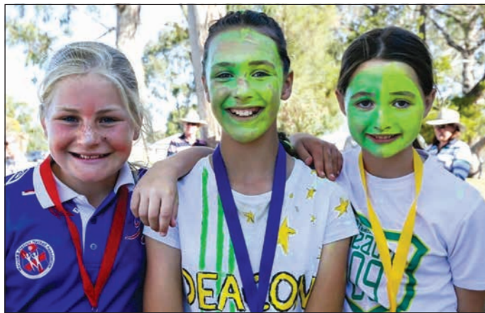
11 Years Girls Champions.