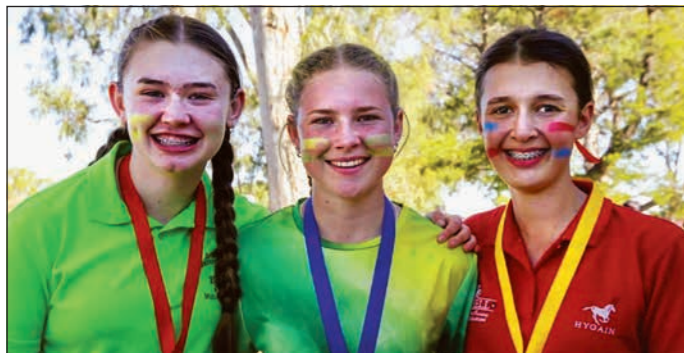
ABOVE: 15-16 Years Girls Champions.