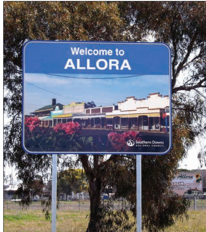
As motorists are driving along the New England Highway they'll now be tempted to call into Allora after spotting the new signs that have been erected on the outskirts of town