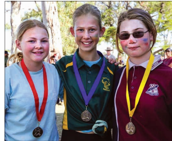
12 Years Girls Champions.