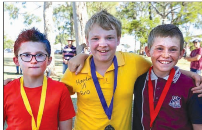
12 Years Boys Champions.