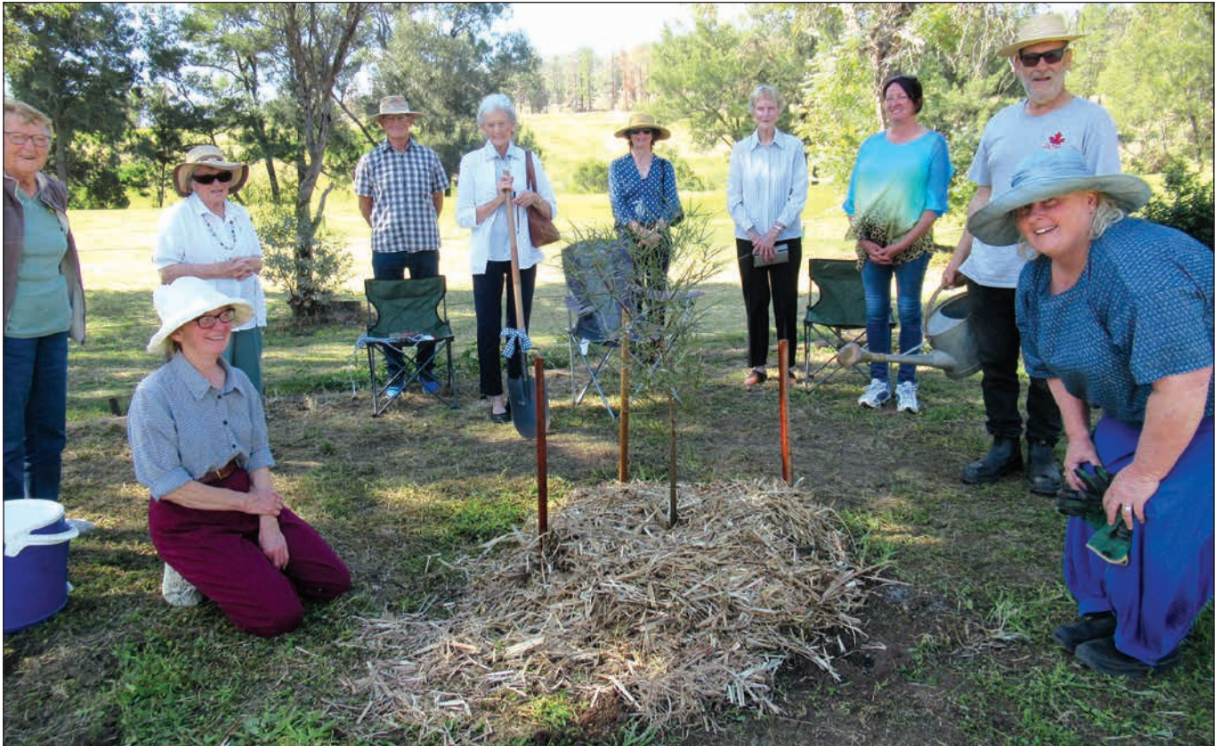
Members and friends of the Allora & District Garden Circle last week witnessed the planting of the Commemorative Bottle Tree on the corner of Raff and Jubb Streets. See photos inside page 5