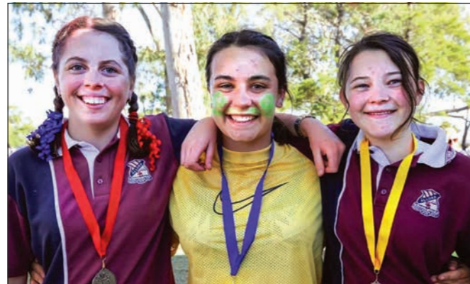
14 Years Girls Champions.