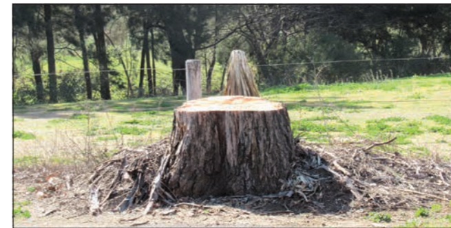
Last remains of the old gum tree that was lost in the drought. - This Poem tells the Story.