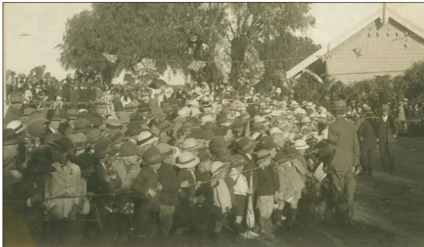
School children at welcome to Prince of Wales, Hendon railway station, July, 1920.