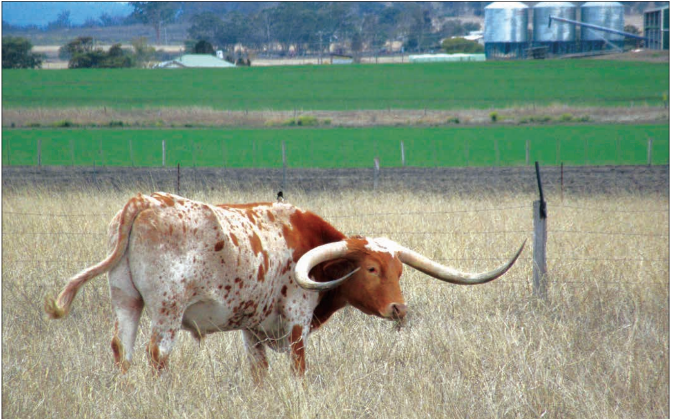
This speckled steer has caught the attention of Allora locals and visitors who have been seen snapping photos as Boo-Boo poses. Story inside, page 7