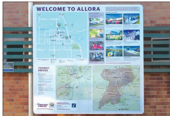
Visitors can check out our guide to Allora map in Muir Street.