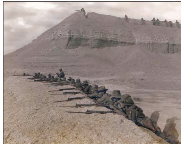
5th A.L.H. in defensive position in Sinai Desert.