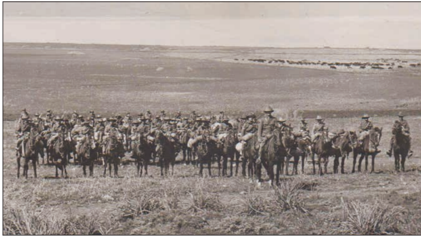
Part of the 5th A.L.H. Regiment on parade in Palestine.

The Australians pursued the retreating Turkish forces across the Sinai Desert