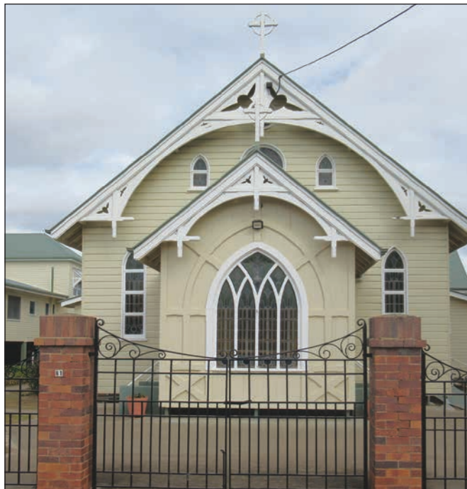
St Patrick's Parish at Allora re-opens its doors after being closed in late March due to Covid-19. Normal masses will be held from this Sunday 12th July. Parishioners are welcome to attend from 5.30pm.