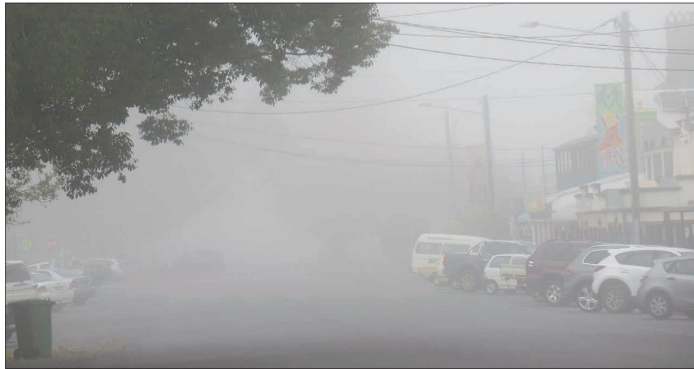
Our main street has been hiding in the fog for the past couple of mornings.