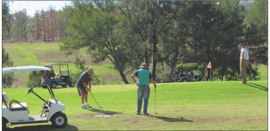
What could be better than a game of golf with a few mates to enjoy the beautiful weather yesterday?