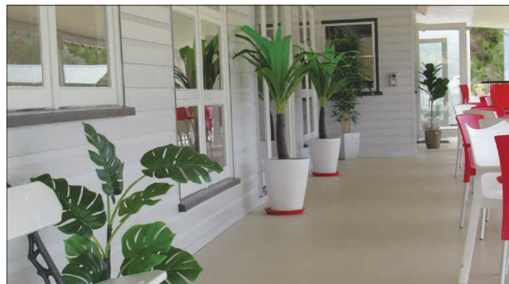
Part of the new-look Allora sports Club.