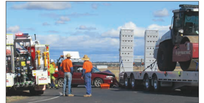
Crash on the outskirts of Allora last Wednesday.

Police issued an infringement notice to the car driver because he had attempted to overtake a turning vehicle.