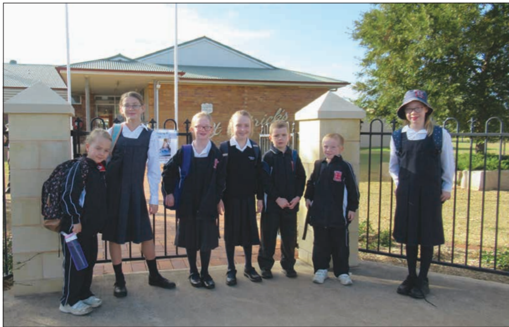
St. Patrick's School Kids happy to return to school.