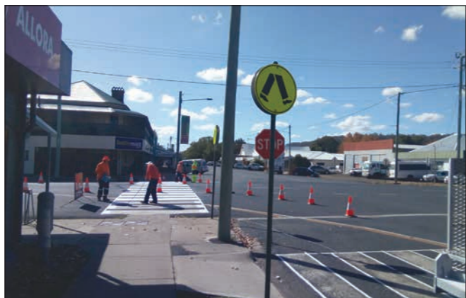
Zebra crossings in Allora's main street received a facelift on Monday.

The Federal Government is delivering a $1.8 billion boost for road and community projects through local governments across Australia - $500 million through the Local Road and Community Infrastructure Program and the bringing forward of $1.3 billion of the 2020-21 Financial Assistance Grant payment.