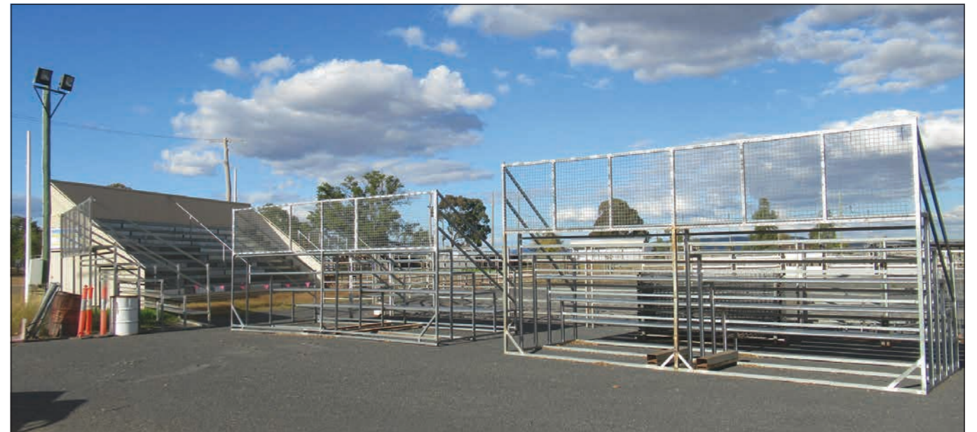
Current seating and area that will be transformed into an expanded, covered arena following the Federal Government Grant.