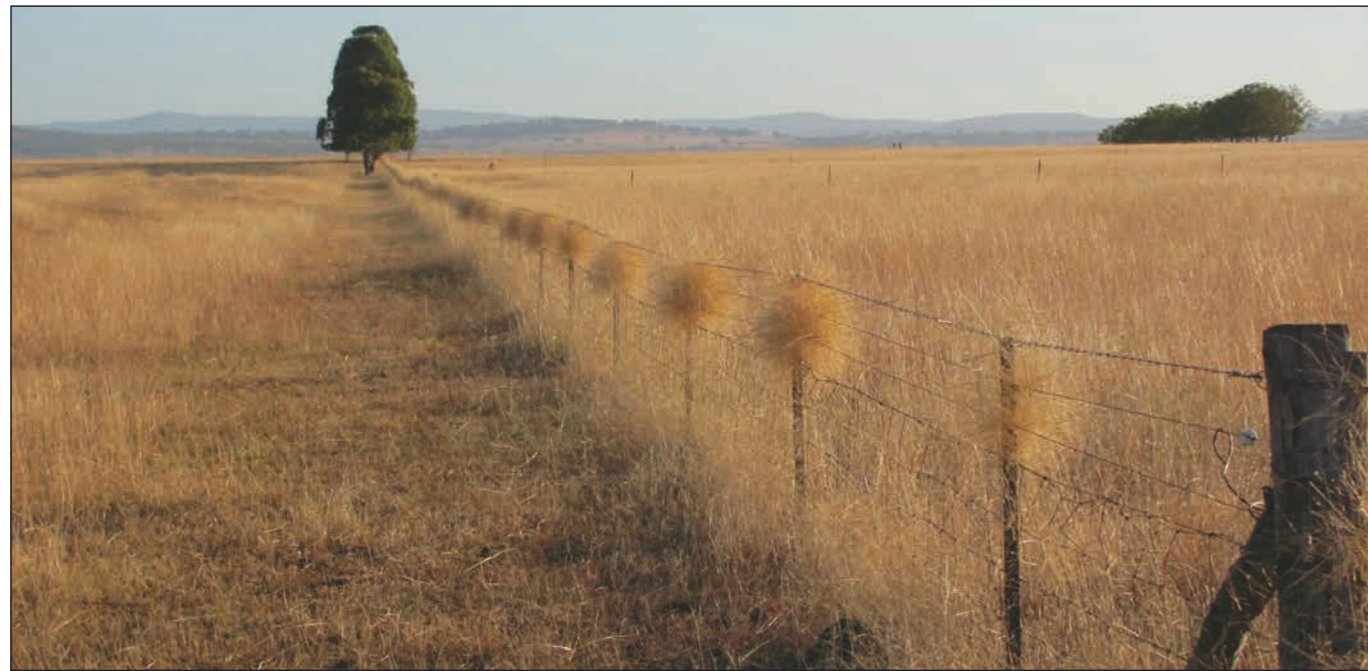
Tufts of grass uniformly caught on every steel post on this fence near Spring Creek.