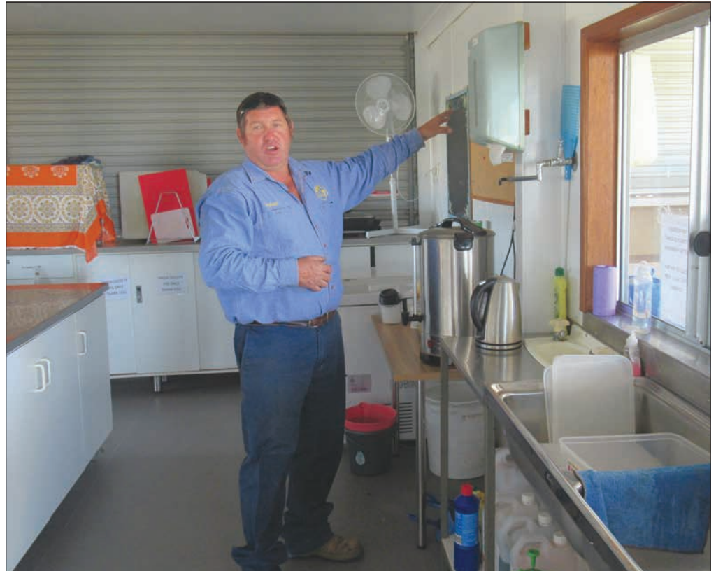
President of the Allora Show Society explaining the renovations to be made to the kitchen and bar area following news of the Government Grant.

20 acres + brick home and mountain views