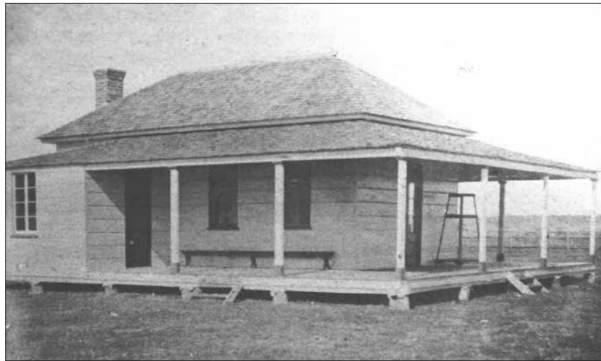
Allora's first Town Hall built in Forde Street in 1870.