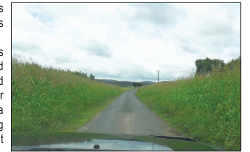
Johnson grass in the Goomburra Valley.

"Alternatively a car only has to drive into it off a road and the hot exhaust pipe will light it up like a cane fire."