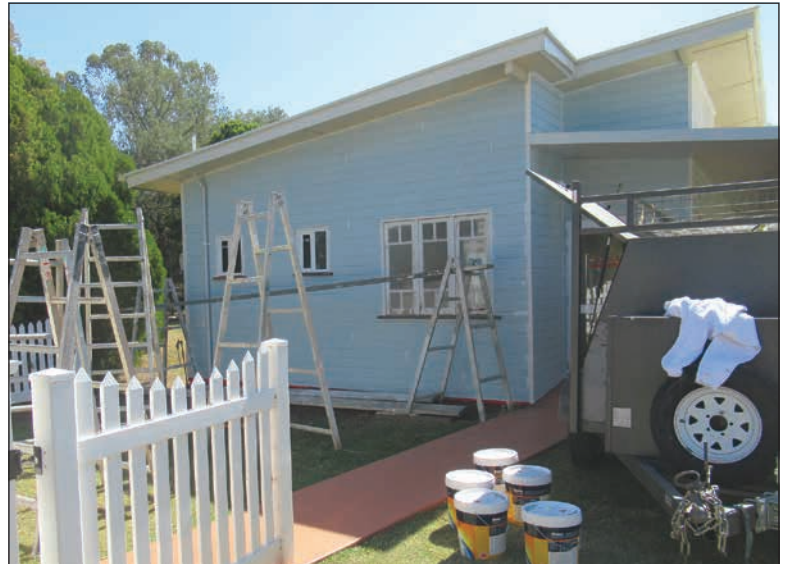
The long-awaited facelift is underway at the Allora Sports Club. Following the securing of a grant last month painting has commenced and members are keen to see the end result as Wendy has promised an impressive colour scheme.