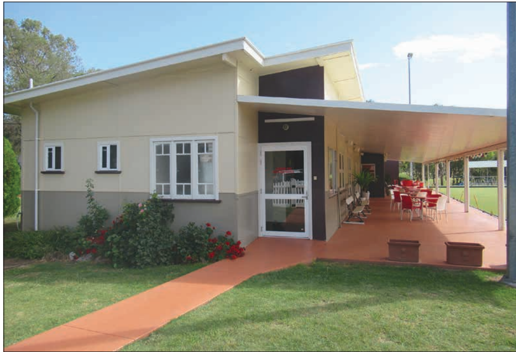
Club house to get exciting new paint job.