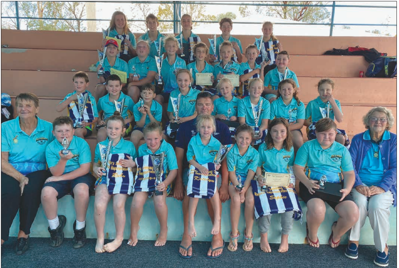
Members of the Allora Swim Team of 2020 enjoy the spoils of their Club Championships and Presentation Day. More photos coming in next week's edition.