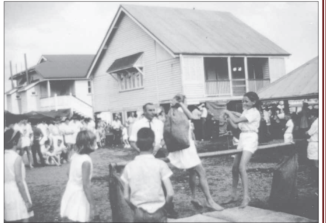
The Allora State School fete in 1964 showing the ex Elphinstone School building with the playshed on the right and the former Rural School building on the left.

A 39-year old Deuchar man appeared in the Warwick Magistrates Court on 10 charges relating to the finding of 134 growing cannabis plants, as well as harvested material, in a raid on a Deuchar property. 56 of the plants were a new strain of cannabis called "skunk week", and were believed to be the first mature crop of the variety found in Queensland.