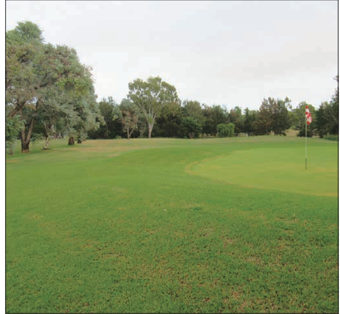
Allora's beautiful Golf Course that no-one can use... except the ducks - they're allowed to play.

As with the bowls green, the golf course will continue to be maintained and will be ready for play immediately the restrictions are lifted. The committee of the Allora Sports Club extends its thanks to the sporting public for their understanding.