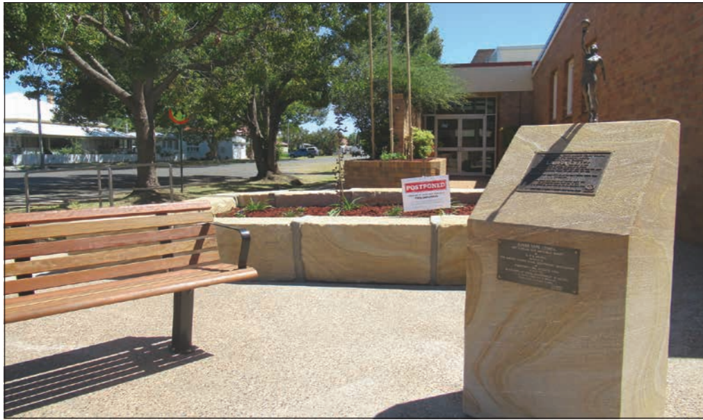
The new park and garden out the front of the Sports Museum.

During the 150 years celebrations it was reburied with 86 new and current contributions from Shire People and organisations, in a ceremony that created history thanks to Burstows Funerals.