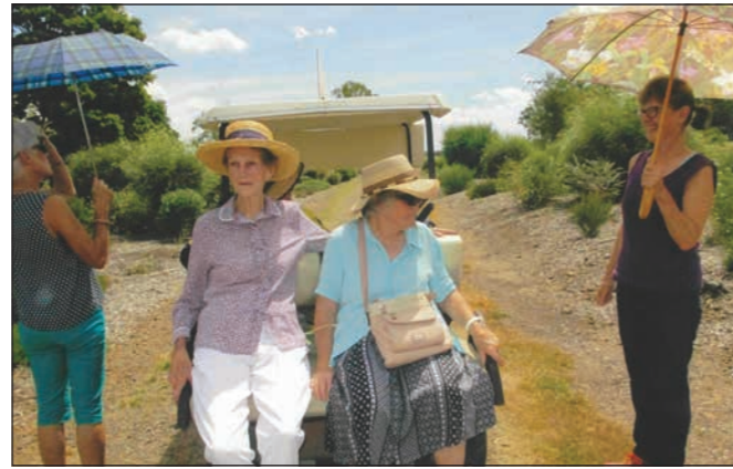
Garden Circlers surrounded by the Rail Trail 2020.

Earlier this month the Allora and District Garden Circle visited Pete's Hobby Nursery in Lowood. The countryside we drove through was thoroughly green and beautiful to