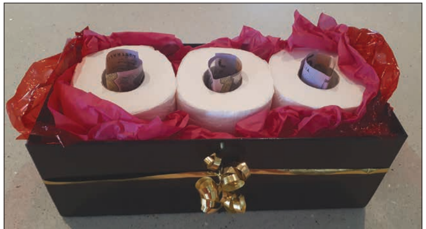
Fire Ants Team trophy.