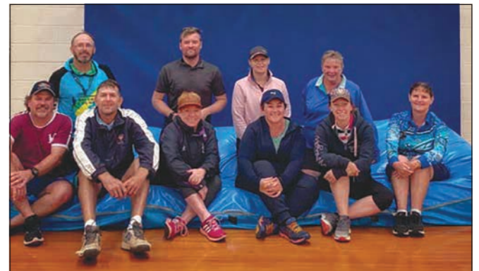
Staff members attending Level 2 Athletics course.