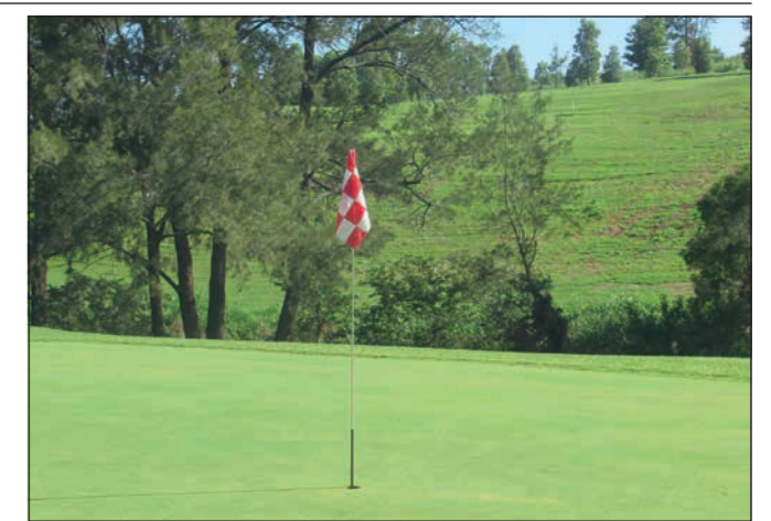
The Golf Course is in outstanding condition thanks to our hardworking volunteers.