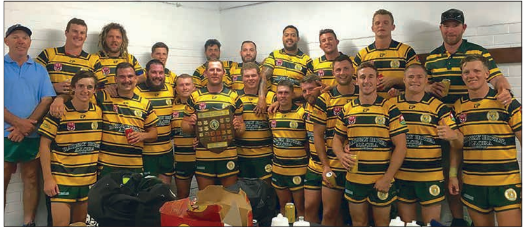
Wattles A Grade side celebrate their 34 – 10 success after snaring the 2019 Barrett Family Shield at Father Ranger Oval.