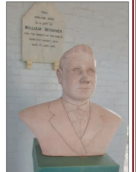
The William Mitchner bust at the Allora cemetery.

At the last meeting of the Allora Municipal Council, the Mayor (Ald. F. Kates) moved with the view of promoting the advancement of the town, that it was desirable that the Council should erect a public flour mill in a central part of the town, under the