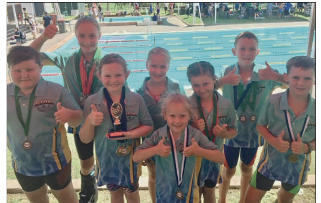
Allora Swimming Club junior members celebrate their wins at the recent Texas swim carnival.