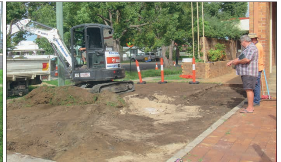
ABOVE: The start of the exciting project.