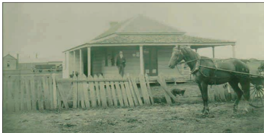
The Allora Town Hall and grounds where the first Allora Show was held in 1879.

After the formation of the C.D.A. & H. Assn. in 1878, the first official "Allora Show" was held on the 17th January 1879. It was held in the Town Hall and grounds on the corner of Forde and Warwick Streets. The weather was very hot and nearly the entire population of the Allora district plus visitors attended. There was a good