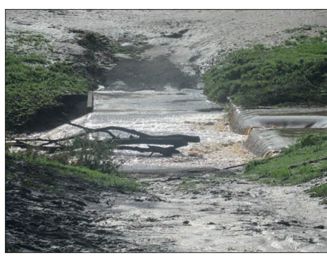
Flooding was still evident on Monday morning in the Dalrymple Creek at the Golf Course weir. The rainfall reading for Allora was 101mm for January and 119mm so far in February.