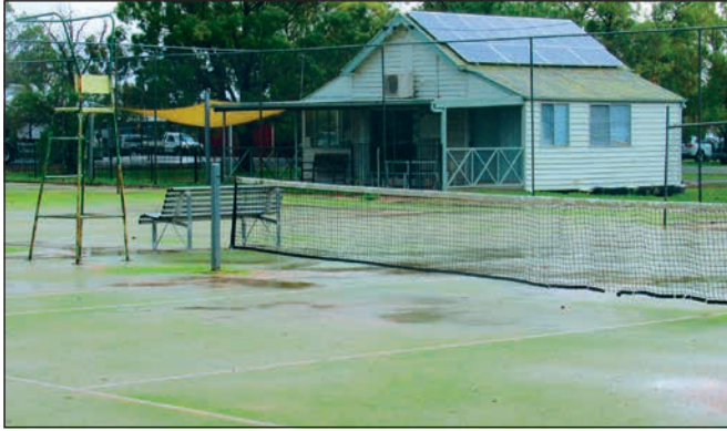
Allora Tennis courts and clubhouse.

South Queensland clubs have launched social tennis with a twist to get more adults on the court. The aim is to improve the health of the regional population through a more sociable and relaxed approach through tennis. There's no longer the need to join a club, sign up for lessons or commit to a weekly competition.