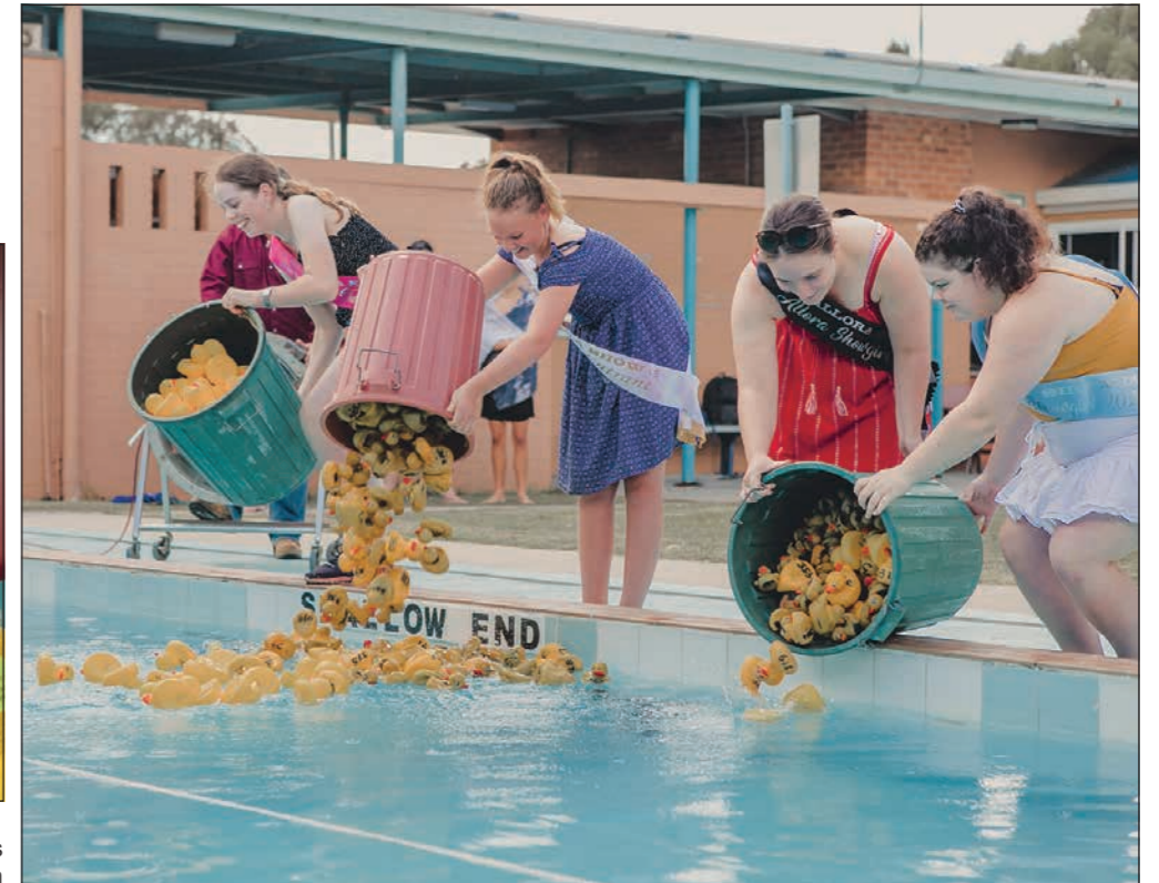
Allora Showgirls dunking the ducks.