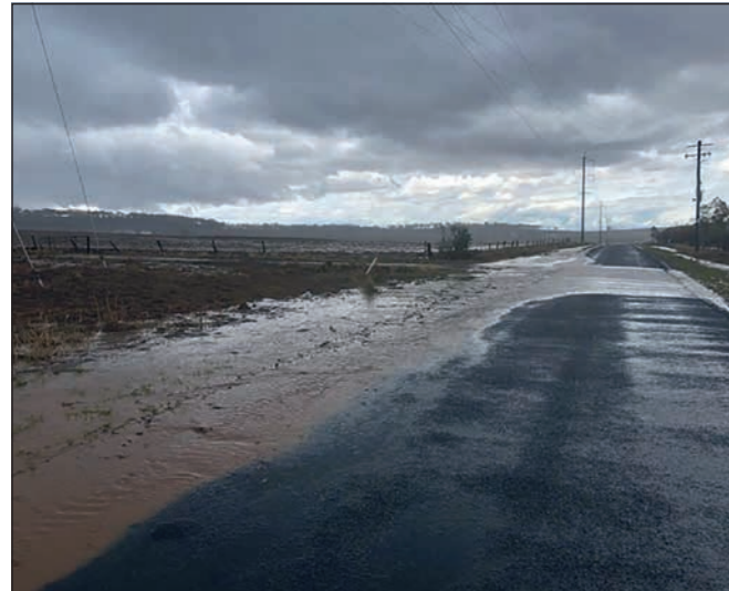
Plenty of water on the Allora-Clifton Road, near Dalrymple Landscaping (photo taken at the weekend).

After ten months of very little rain, the Allora district has received welcome falls during storms over the last week.