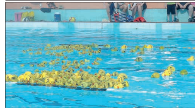
Last year's Ducks frantically clamouring towards the finish line.