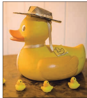
Tickets for the Dalrymple Duck Race can be purchased this Friday morning outside Allora Pharmacy.