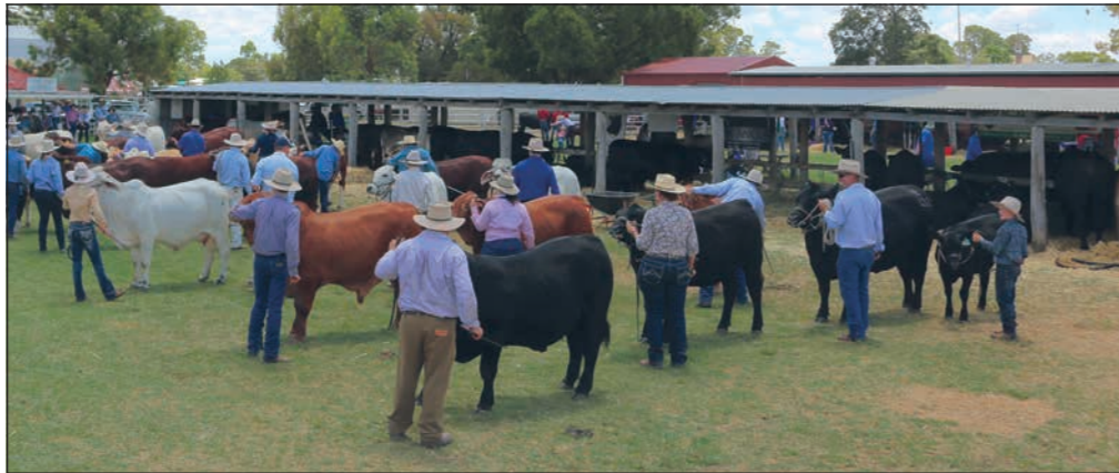
Judging of beef cattle at the 2019 Allora Show.

Special events that you won't want to miss - Friday night the Bull Ride as another round of the Border Region Buckle Series continues with Junior Bull riders going for a buckle in the series.