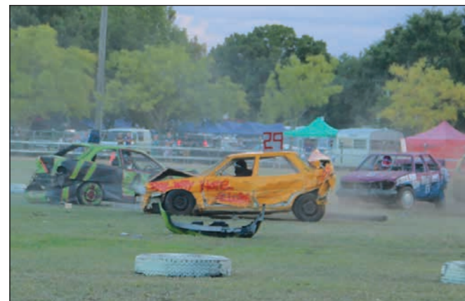
Plenty of smashing good fun at last year's Demolition Derby.

The FMX Motorcycle Spectacular is back by popular demand and everyone enjoys the Smash-up Derby. Weather permitting there'll be a spectacular Fireworks display.