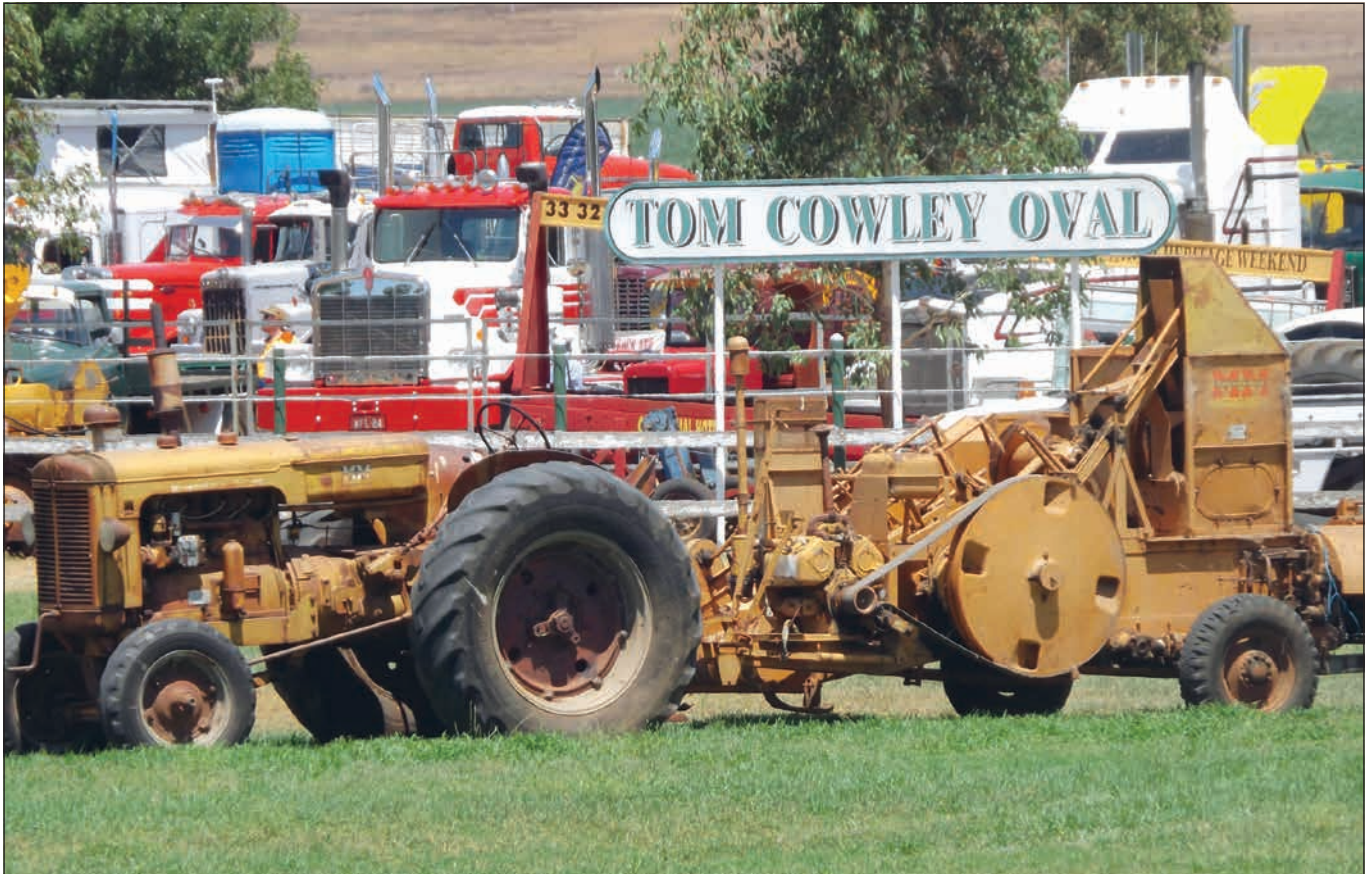
For more details on this year's Allora Heritage Weekend, see inside.