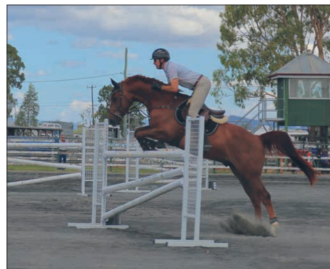
Action from the 2019 Allora Show.