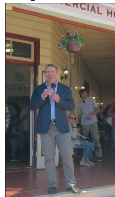
Don't laugh - I reckon I was the best Prop the Broncos ever had.