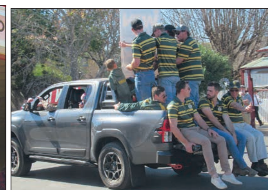
The Wattles hitching a ride, obviously saving their energy for the Finals!