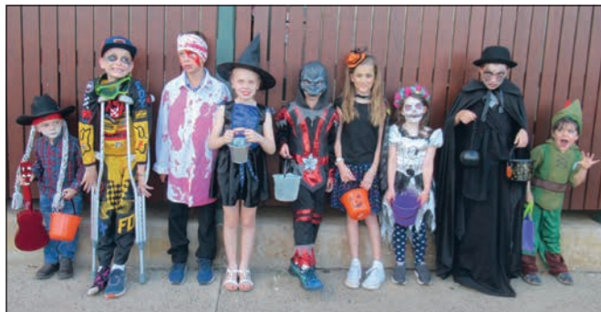
This year's Halloween activities in Allora have been described as the best ever with well over a hundred children participating.