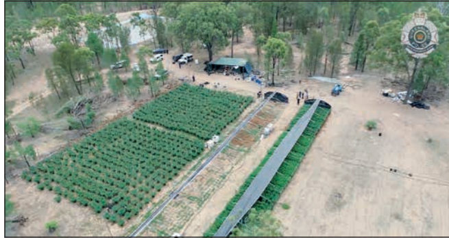
Police and detectives on site at Old Talgai.