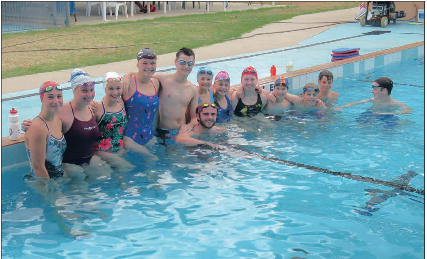
Fidgey's fish training group at the Allora Pool - twice a day - plenty of future champion swimmers here!