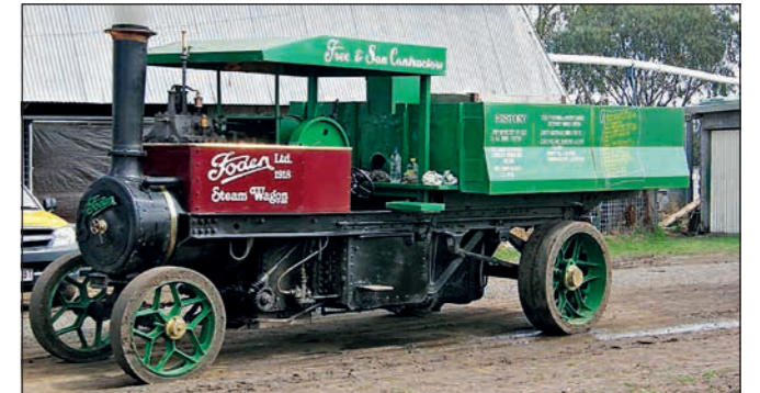
The 1918 Foden Steam Wagon will make an appearance at this year's Allora Heritage Weekend.