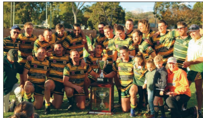
Wattles winning team for 2019 Madsen Rasmussen final.