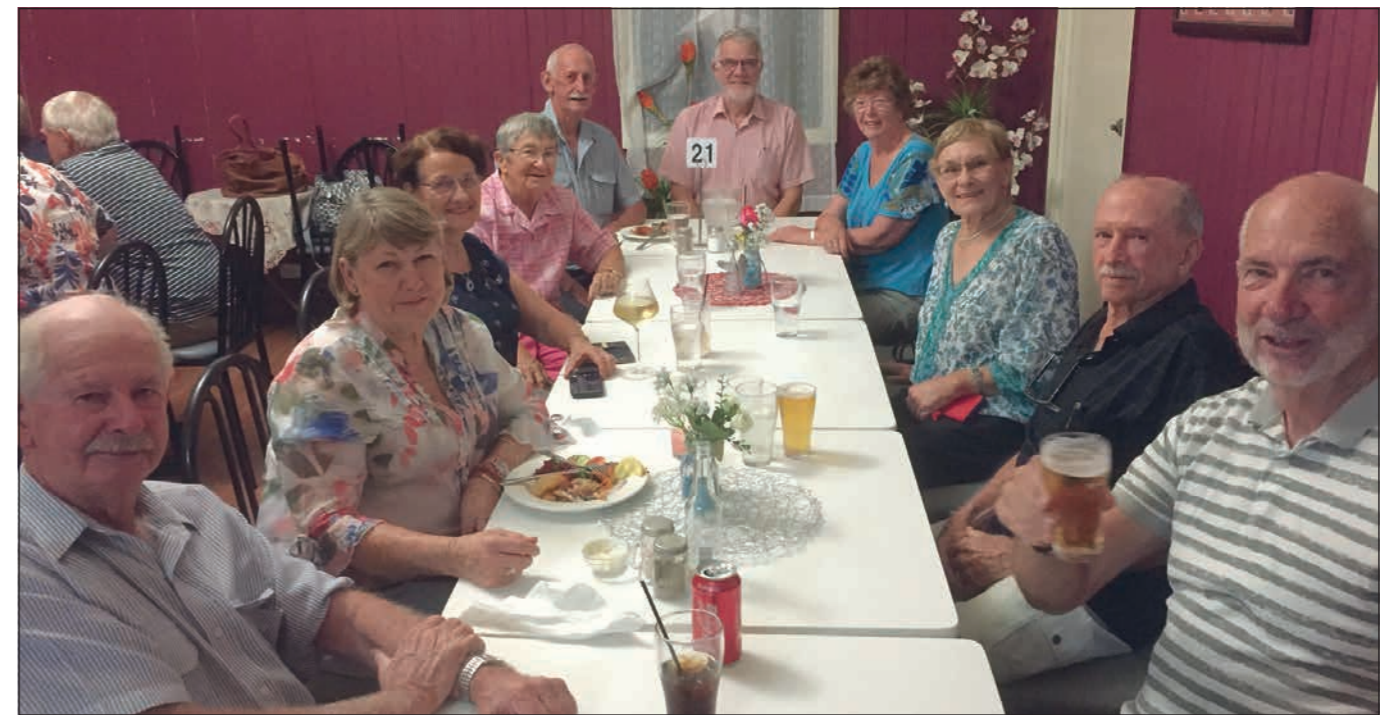
Committee members of the Allora Community Bus with members of ARAD celebrating at the Railway Hotel. After dinner they were taken on a tour around Allora to view the Christmas lights.