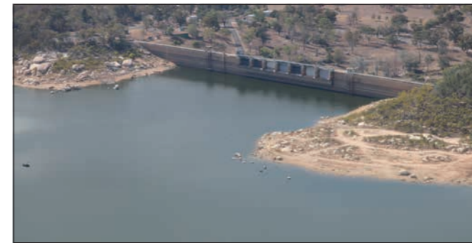
Leslie Dam levels are dropping quickly with the impoundment at 6.22% on Monday. Photo taken with co-operation of Lone Eagle Flying School