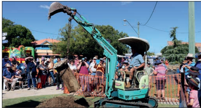
The time capsule being lifted out of the ground in front of Allora Regional Sports Museum.