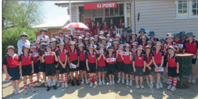
Australia's largest child safety event of its kind. Students from St. Patrick's School in Allora were walking around the streets of Allora.