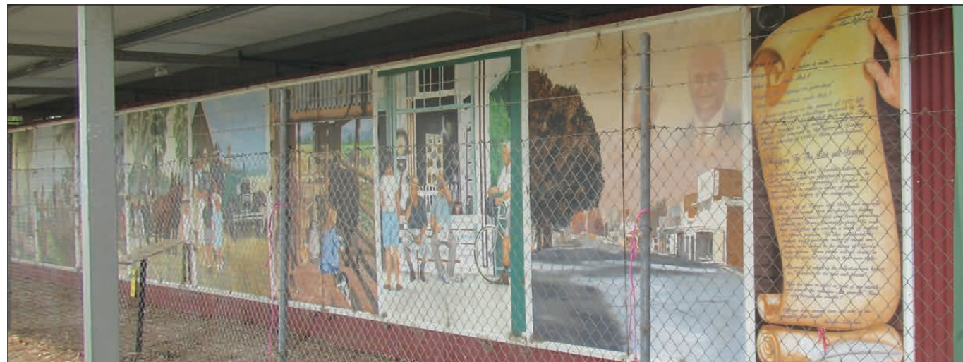
Beautiful murals at the Allora Showgrounds tell a pictorial story of Allora.