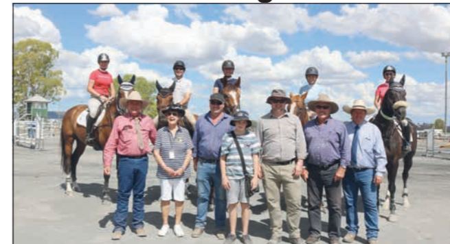
Members of the Cowley family and Show officials with the top 5 Show Jumping contestants.