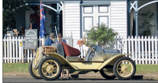
Allora celebrates the 2019 Allora Autumn Festival with a range of exciting attractions.