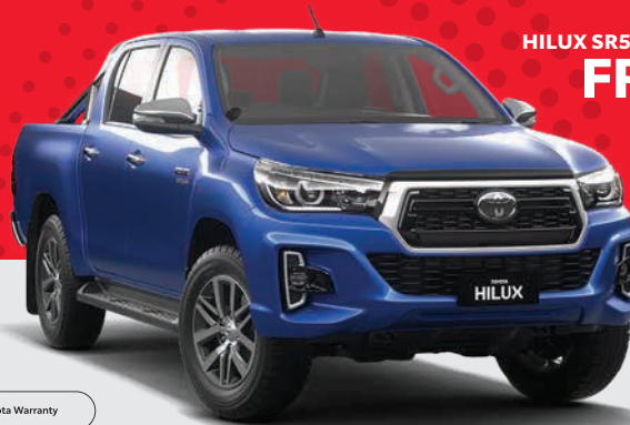
PLATE CLEARANCE AT BLACK TOYOTA MAKE ANY EXCUSE

HILUX SR5, SR & WORKMATE 4X4 RANGE FREE AUTO UPGRADE VALUED AT $2,000 [A] 2.9% ANNUAL PERCENTAGE RATE [F3] FOR BUSINESS APPLICANTS Max finance term of 48 months. Offer Extended