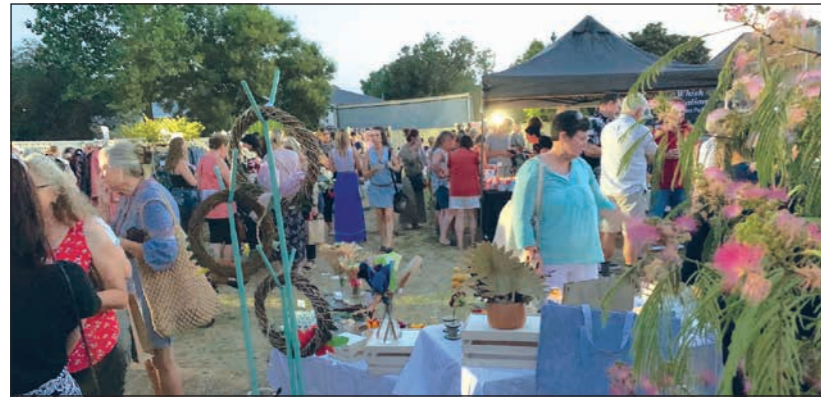
Crowd enjoying Boho Markets in Allora.