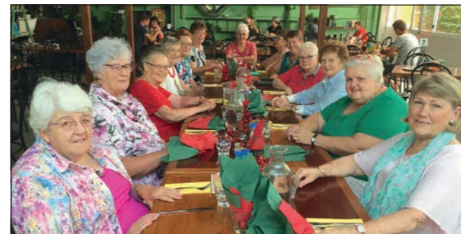
Scope Christmas lunch at Gardens Galore.