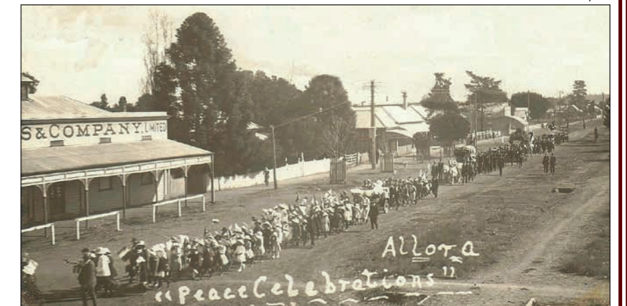
Peace celebrations in Allora in 1919.