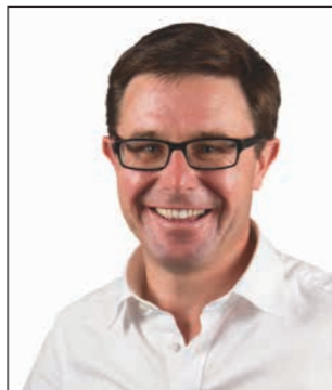
David Littleproud MP.

Federal Member for Maranoa, David Littleproud has welcomed the decision of the Charities and Not-for-profits Commission to strip Aussie Farms of its charitable status.