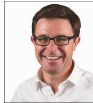
David Littleproud MP.

What could your community do with up to $10 million?