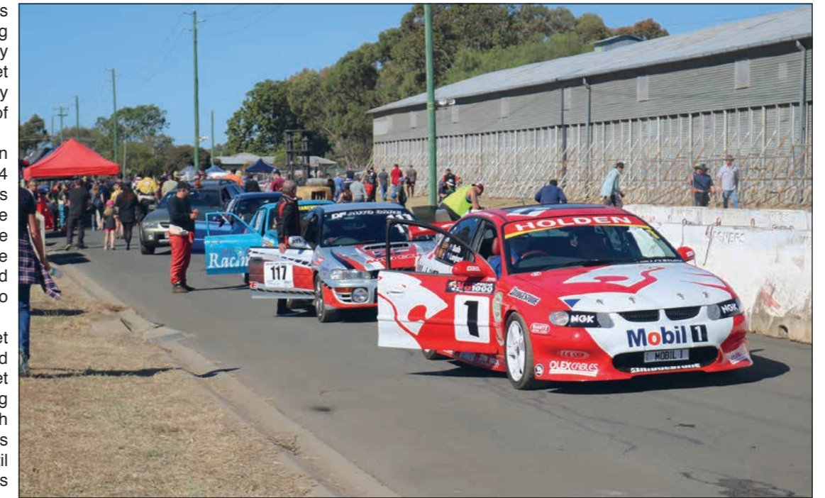
Large crowds gather at the starting line for the 2018 Oakey Street Sprints.

Admission prices differ each day with entry for Saturday being $15 for adults, $10 for concession and students and $30 for a