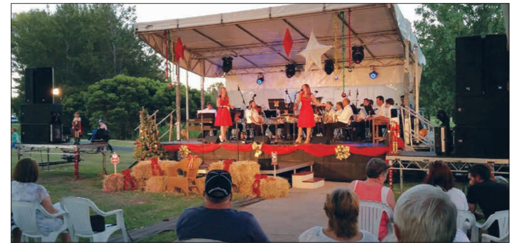
Performers on stage for the 2017 Carols in the Country.

It is small town warmth, connecting with friends and loved ones and awakening the Christmas Spirit. It has been a trying year for our drought affected region so it is also imperative that the occasion be free for all families to attend. Local clubs and businesses will have food and drinks on offer but there is always the option of packing your