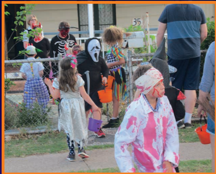
Just been in for trick or treat.