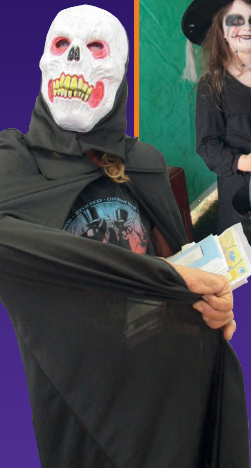
LEFT: Guess who this is??