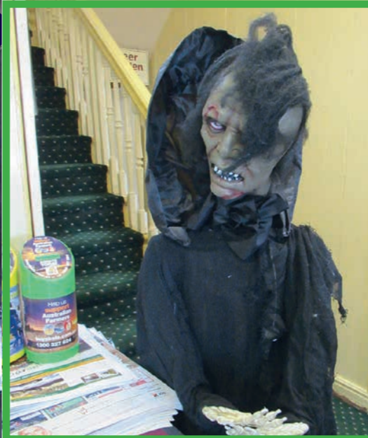
Ordering a beer.