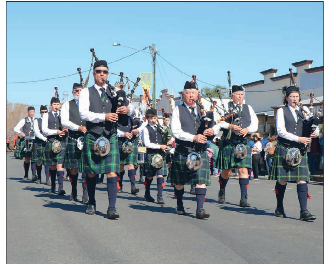
The Warwick Thistle Pipe Band marching down Allora's main street at the 150 Years celebrations

The Warwick Thistle Pipe Band is well known thoroughly the region, taking part in the Grand Parade at Allora's 150 years celebrations in July this year.