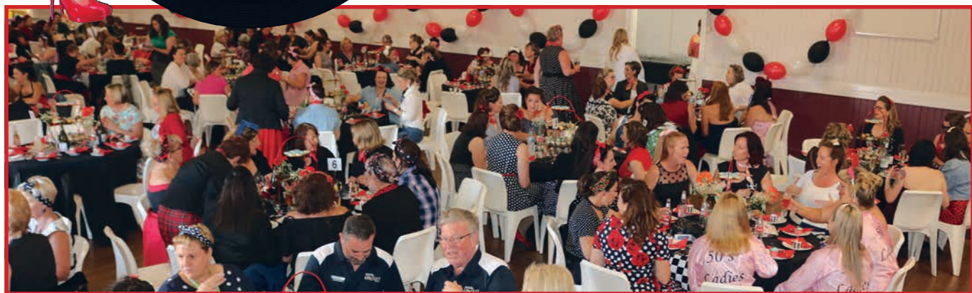
Over 200 ladies attended the fun afternoon which raised money for local charities.