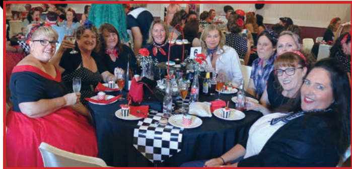
RIGHT & BELOW: Enjoying the annual High Tea which has become a popular social event in Allora.