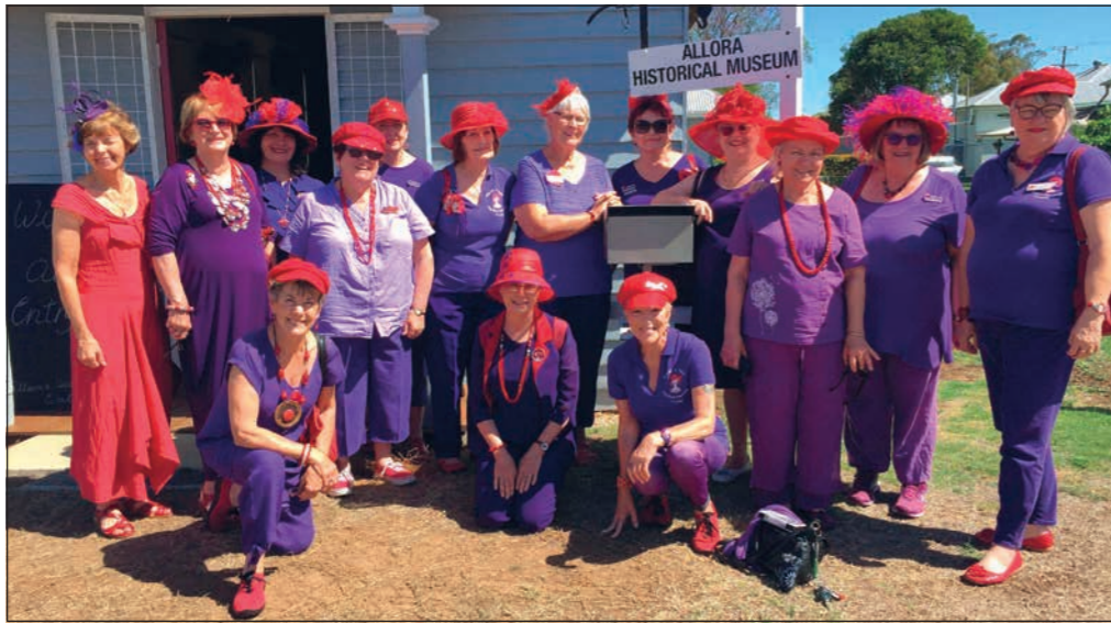
A group of Brisbane Red Hatters stopped in at Allora Museum on their way through to Toowoomba last Friday.