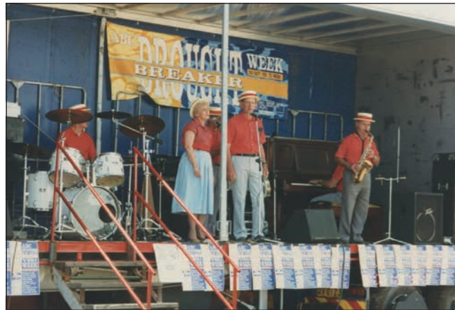
Happy Wanderers performing at the ABC Drought Breaker Concert in 1994.