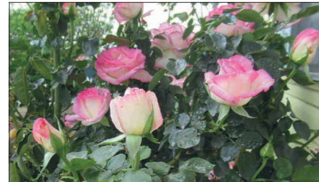
The Princess De-Monaco Rose.