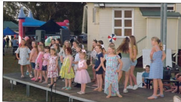
ABOVE: Blazer Bear made an appearance to the delight of many youngsters. RIGHT: School students provided musical entertainment.