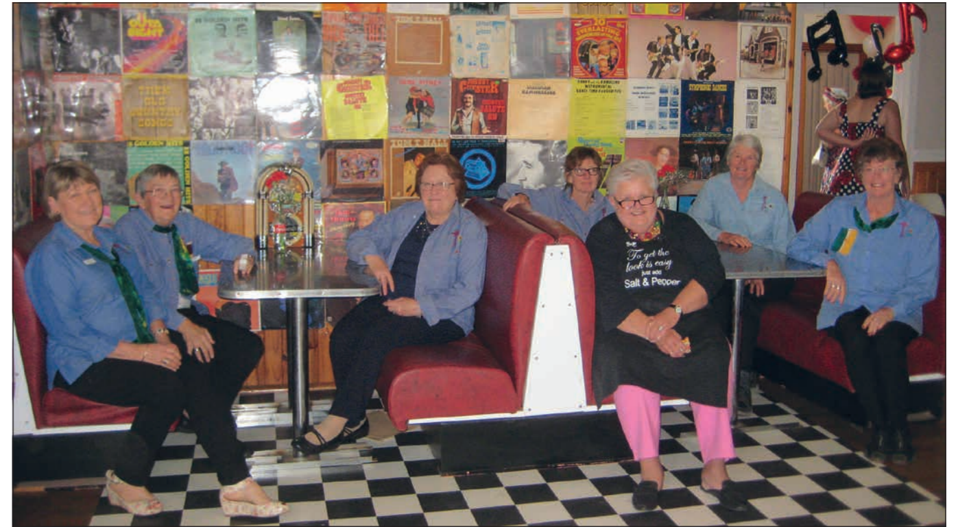
Members of Scope having a well earned rest after their involvement with the Allora High Tea.