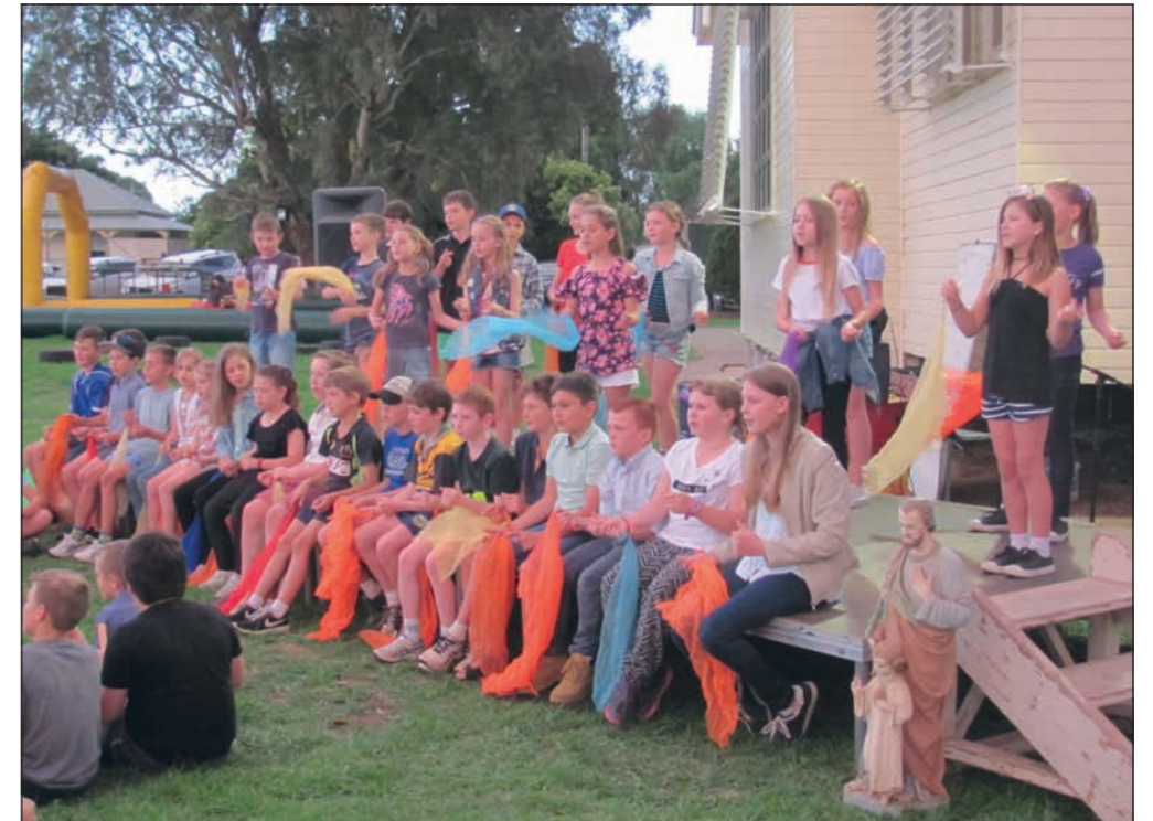
St. Patrick's School students entertaining the crowd at last year's School Fete.

An event the whole community looks forward to, come and join the fun at the St Patricks School and