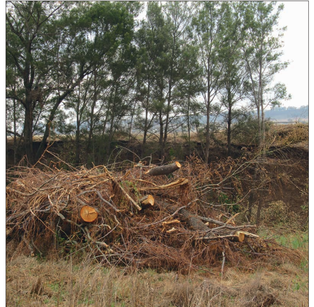
River bank - Dalrymple Creek.

A meeting of the Warwick River Trust this week will discuss how further funding could be obtained to overcome a major problem of wild peach which is growing prolifically along a two kilometre stretch of Dalrymple Creek to the east of Allora.