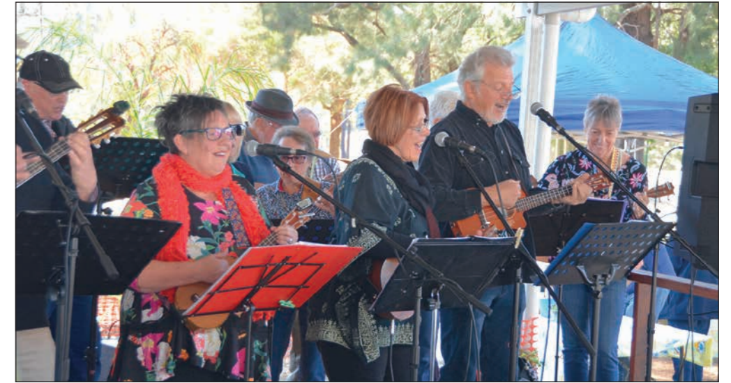
RIGHT: Wuppies band performing at the RSL Cafe.

Book early - Limited seats available. RSVP to Kath on 4666 3542 / 0407 045 267 by 23/10/2019