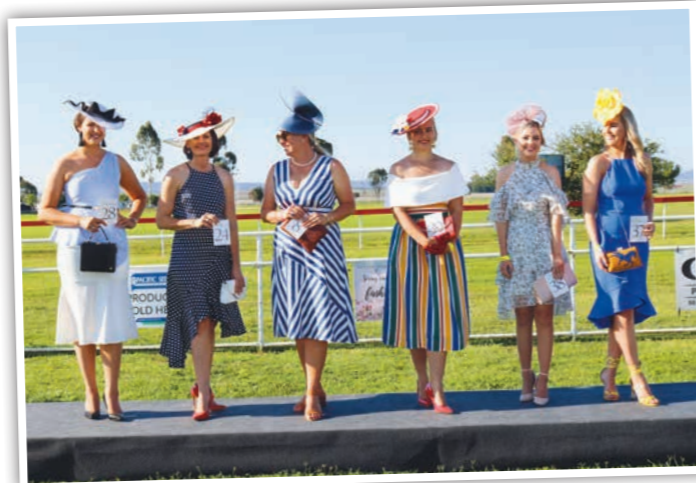
There are plenty of things to do and see for this year's Country Week so make sure to mark the events that interest you in your calendar and help support a country town putting on one big show.

Fashions on the Field will celebrate the best dressed in attendance, with more than $4,000 worth of prize money to be won.